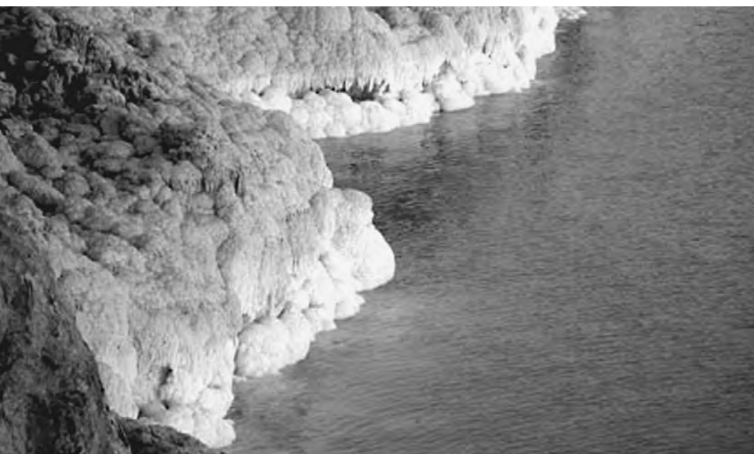
Nature's wonder: Fed by the Jordan River, the Dead Sea has a high salt concentration, as these salt crystals along the coastline reveal.