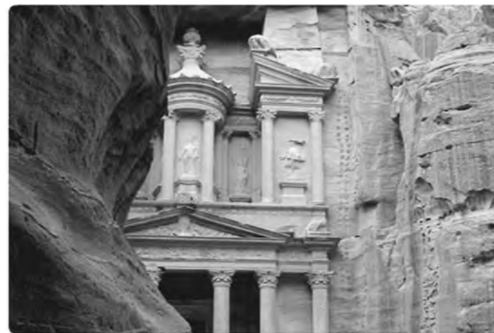
Cultural wonder: Half-built and half-carved into the rock by the ancient Nabataeans, the historic city of Petra is a UNESCO World Heritage site and Jordan's most-visited tourist attraction.

trasts from Jordan Valley, the Dead Sea, which is a nominee for the New Seven Wonders of Nature, to Petra, another fantastic historic city and one of the New Seven Wonders of the World. Much more awaits you to enjoy from the moment you land in Jordan, which scholars describe as an open air museum. Ahlan Wa Sahlan ( Welcome as a cherished guest).