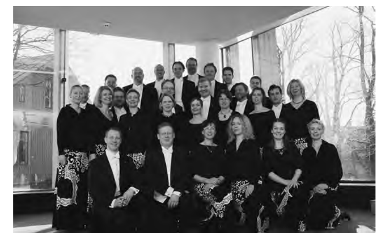
Vocal chords: The Swedish Radio Choir will perform in Nagoya, Osaka, Kanagawa and Tokyo between June 12 and June 19.

For more information, visit www.eufilmdays.jp