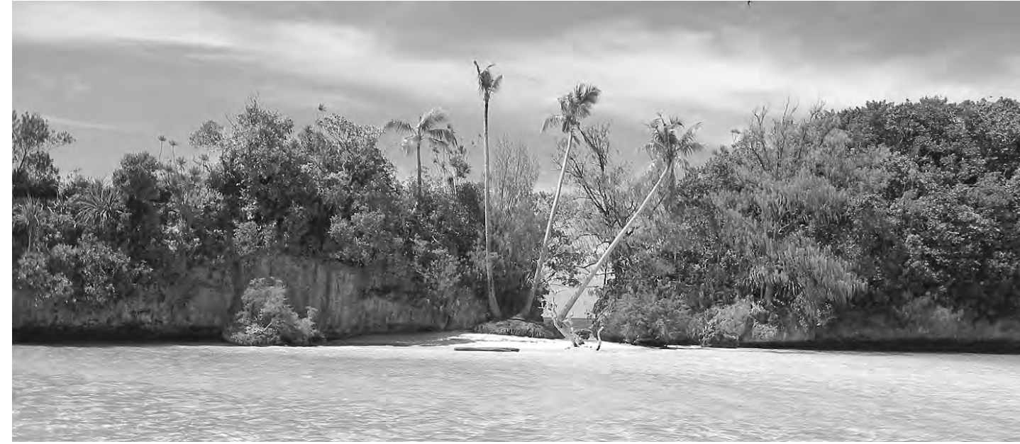
Heavenly beach: Palau is becoming a popular destination with resorts providing a relaxing tropical vacation.

Finally, I congratulate Prime Minister Kan for his confirmation as prime minister of Japan, and I sincerely hope H.E. Kan will find time during his term to visit our island nation as our most special guest. May God bless Japan and the Republic of Palau.