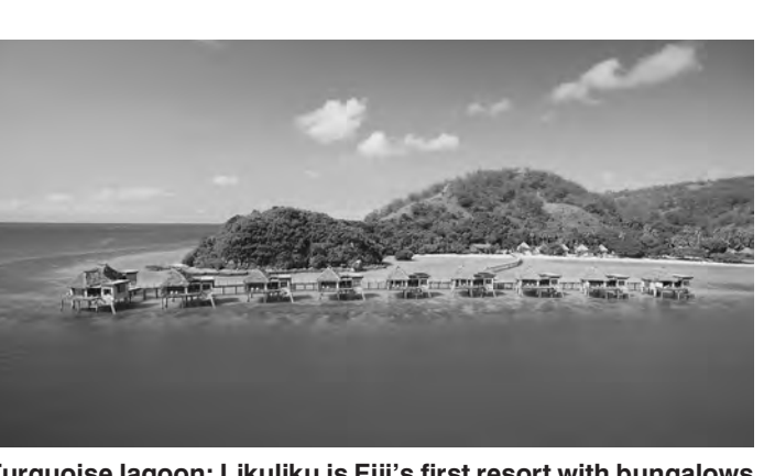
Turquoise lagoon: Likuliku is Fiji's first resort with bungalows set up above the water.

Grant Aid Project Completion Amount ICT Center (Phase 2) Onaoina F$18 Million at the University of the South Pacific ICT Center (Phase 1) Technical March 2010 E$45 Million at the University of the South Pacific New Pharmaceutical Center 2004 F$17.65 Million 8.69 New Pediatric Unit at F$21.8 Million 2000 the Colonial War Memorial Hospital 5.85 Construction of Marine Studies Facilities 1998 US$11.9 Million at the University of the South Pacific (Amount in ¥100 Million) Fiji Meteorological Center 1998 F$16.6 Million