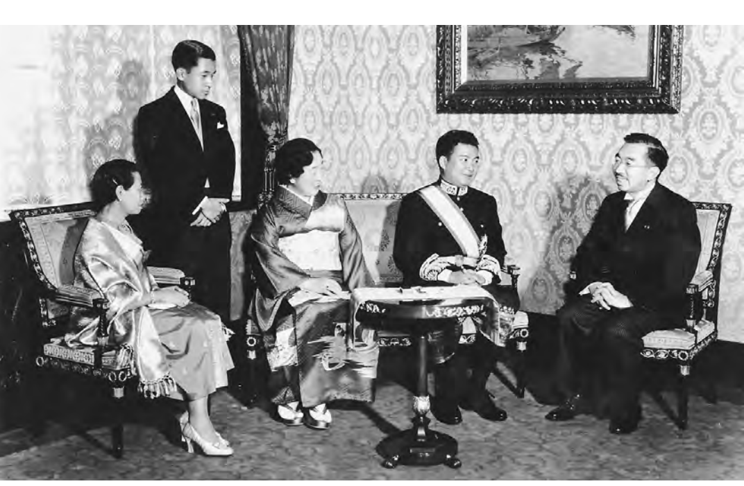
Key meeting: Then Prince Norodom Sihanouk meets then Emperor Hirohito (posthumously known as Emperor Showa), then Empress Nagako and then Crown Prince Akihito during his visit to Japan in December 1955. ROYAL EMBASSY OF CAMBODIA