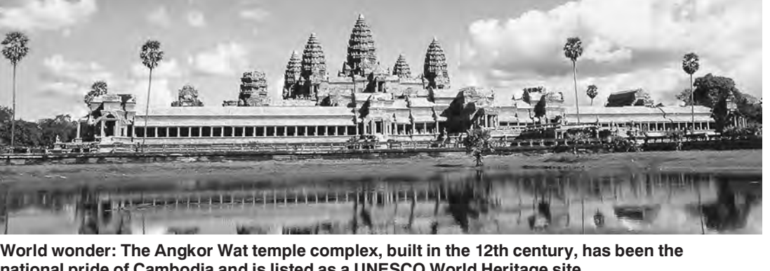
national pride of Cambodia and is listed as a UNESCO World Heritage site.

Given the country's consid erable achievements over the past 15 years, the Royal Government has often cited in pub lic that Japan's assistance and active involvement in the reconstruction and development