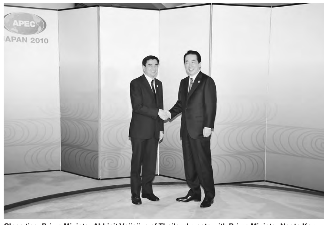
Close ties: Prime Minister Abhisit Vejjajiva of Thailand meets with Prime Minister Naoto Kan during the APEC summit held in Yokohama in November.

We would like to express our heartfelt wishes for the furthering of cooperation between Japan and Thailand in various fields, including infrastructure development and green technologies, with the continued prosperity of His Majesty King Bhumibol and the people of Thailand.