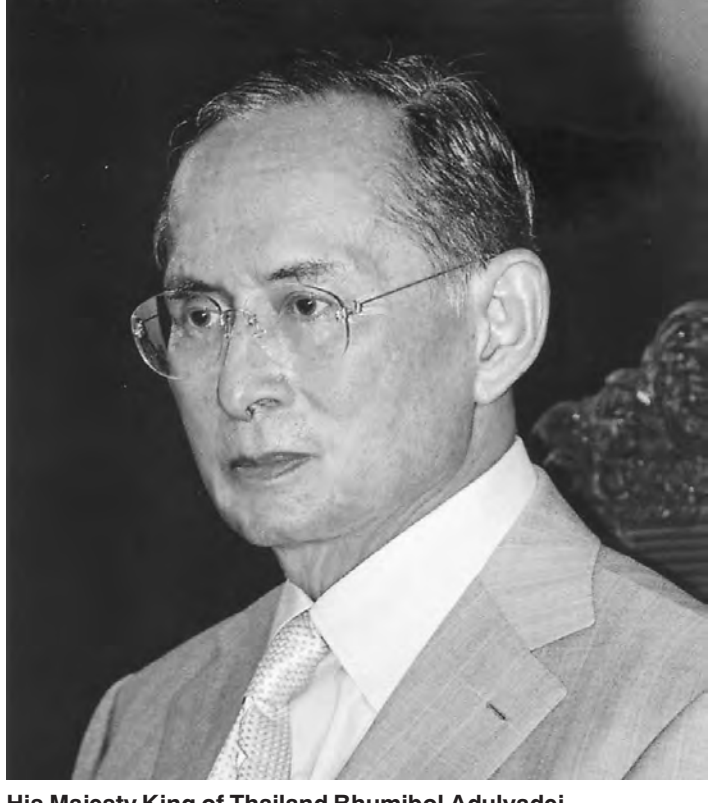
His Majesty King of Thailand Bhumibol Adulyadej

Following the opening of the new International Passenger Terminal at Tokyo International Airport (Haneda), Thai Airways International has also opened a new route connecting Haneda to Suvarnabhumi Airport with seven flights a week, raising the carrier's number of weekly flights between Tokyo and Bangkok from 21 to 28. The countries and thus also closer