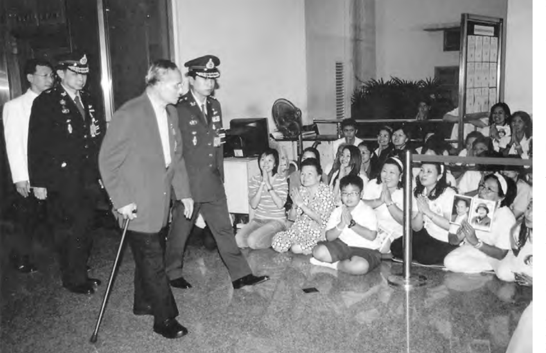
Revered: Thai citizens hold their king in the highest regard.

On this auspicious occasion of His Majesty's birthday, I again sincerely hope the relationship of mutual trust fostered between Japan and Thailand over a number of years will continue to grow even more and become even stronger in the future.