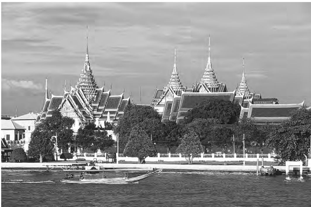
Majestic: The Grand Palace in Bangkok has been the official residence of the kings of Thailand since the 18th century, having been constantly expanded over time.

Finally, may I express my gratitude and appreciation to The Japan Times and its readers for making this year's celebration meaningful.