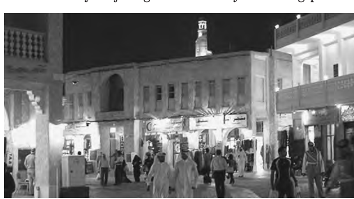
Traditional market: The newly restored Souq Waqif is one of the top tourist destinations in Doha.

Qatar and Japan have been traditionally strong and friendly, and are steadily developing, characterized by fruitful energy, trade and economic cooperation, and the two sides' desire and commitment to transform them into a multifaceted and mutually rewarding partner-