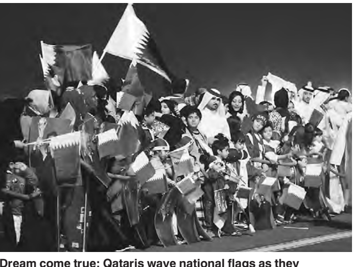
Dream come true: Qataris wave national flags as they celebrate in Doha on Dec. 3, the day after world soccer's governing body FIFA announced the Gulf city will host the 2022 World Cup.