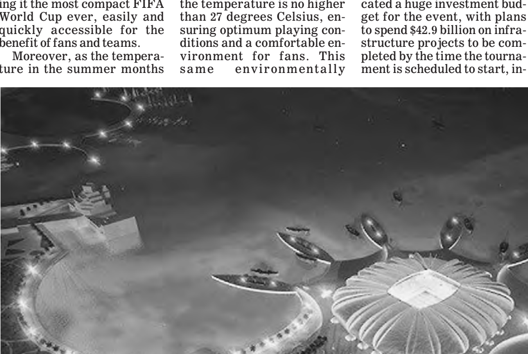
Cool design: The new Doha Stadium will be a completely modular venue with 44,950 seats. The stadium, which will sit on an artificial peninsula in the Gulf, is designed to evoke its marine setting. Water from the Gulf will run over its outer facade, aiding the cooling process and adding to its visual allure. EMBASSY OF QATAR