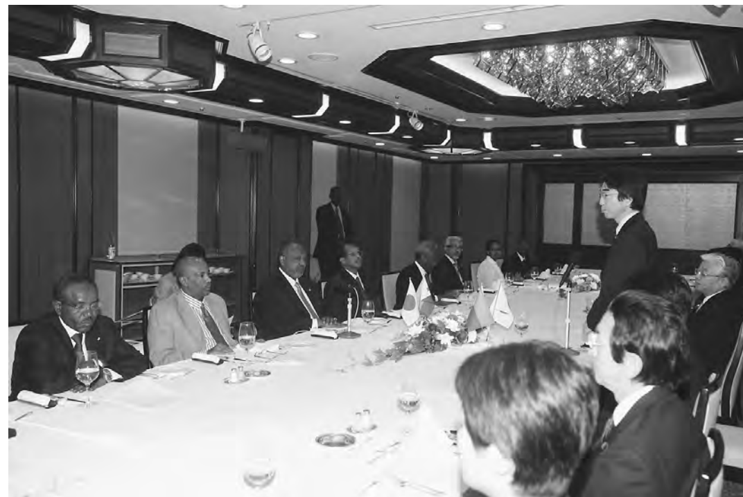
Djibouti President Ismail Omar Guelleh (third from left) meets members of the Japan-Djibouti Parliamentary Friendship Association in Tokyo on Dec. 20

The signing of an MOU during this visit has paved the way for an ambitious undertaking of a hospital using the management and the advanced medical technology of Japan for the benefit of local patients, most of whom would not have had the chance to get such treatment without traveling overseas. In conclusion, I would add that the visit has enhanced the bilateral relationship between Djibouti and Japan, and could contribute to the mutual benefit of the Japanese and Djibouti people.