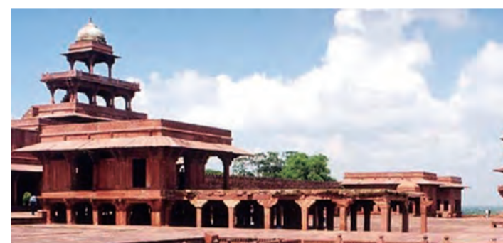
Imperial capital: Fatehpur Sikri, built by Mughal emperor Akbar, is a UNESCO World Heritage site.

I send my best wishes to the people of India for their further prosperity and for the continued development of our cordial relationship.