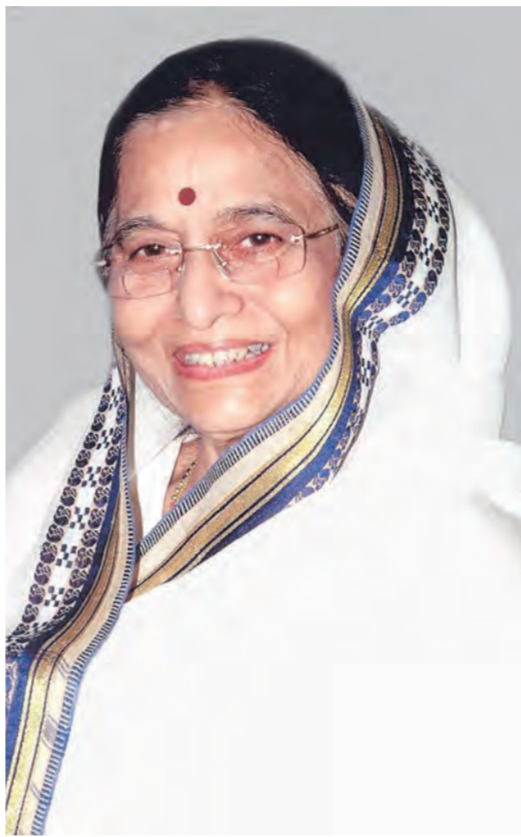
President Smt. Pratibha Devisingh Patil

in October 2010 for the Annual Bilateral Summit. A major outcome of the visit was the joint declaration on the conclusion of a Comprehensive Economic Partnership Agreement (CEPA) between our two countries, which confirms our mutual pursuit of the future as close partners. In fact, the CEPA not only adds a new dimension to our Strategic and