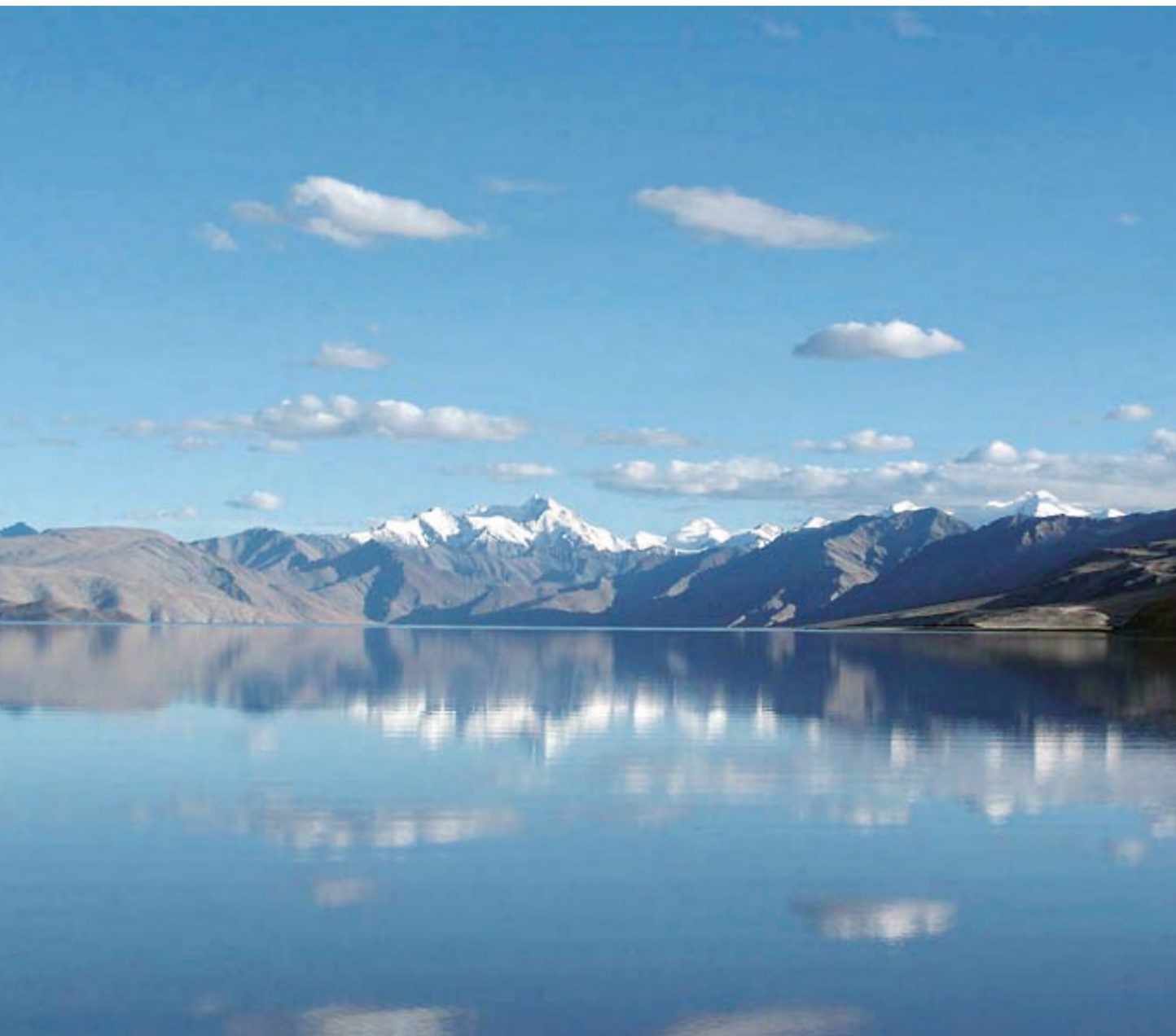
Nature: Tso Moriri Lake in Ladakh is part of a wildlife reserve. INDIA PERSPECTIVES