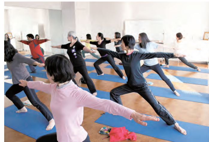
Health: A yoga class at the ICC in Tokyo INDIA EMBASSY

For more information, please visit the website of the Embassy of India, Tokyo.