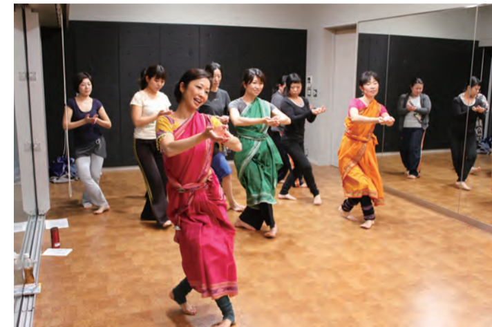
Culture: An Odissi dance class at the ICC INDIA EMBASSY