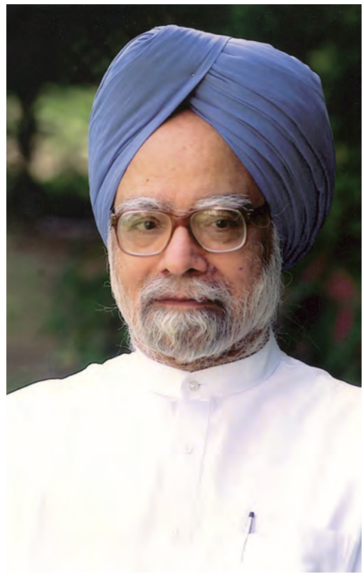
Prime Minister Dr. Manmohan Singh

It has been the vision of Prime Minister Dr. Manmohan Singh to ensure a qualitative transformation of India-Japan relations to realize their true potential. The India-Japan Strategic and Global Partnership has been imparted a further momentum and continuity by the prime minister's landmark visit to Japan