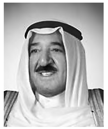
Amir of the State of Kuwait Sheikh Sabah al-Ahmad al-Jaber al-Sabah

On the other hand, the State of Kuwait has adopted the principles of democracy. After its independence in January 1962, a law was enacted to establish a Constituent Assembly in charge of "drafting a constitution that defines the system of government based on the principles of democracy and inspired by the reality of Kuwait and its objectives." The constitution was adopted by the Constituent Assembly in a session held on Nov. 3, 1962, and was approved, without any amendments, by the late Amir of Kuwait Sheikh Abdullah al-Salem al-Sabah on Nov. 11, 1962. Consequently, Kuwait entered an new era of constitutional legitimacy. Since then, democracy has prevailed in Kuwait, raising it to the ranks of civi-