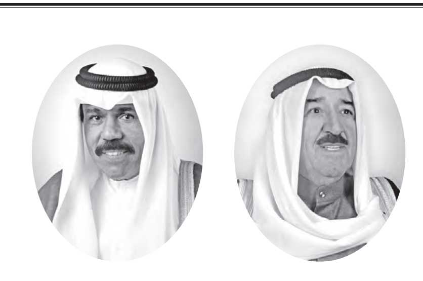
Heartiest Greetings and Congratulations