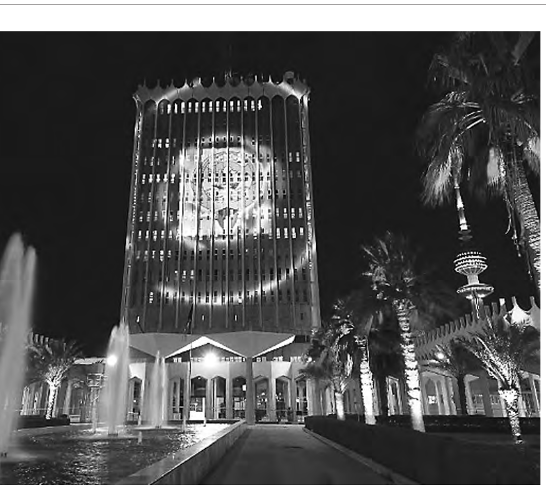
Illuminations: The new building of the Ministry of Information, with the national symbol projected on the facade, and the 372-meter Liberation Tower (right), completed in 1993, are landmarks of Kuwait.