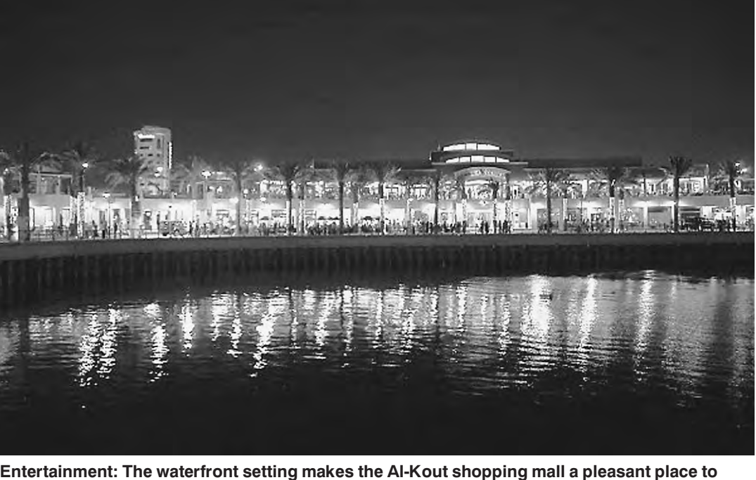
relax, shop and dine. EMBASSY OF KUWAIT

In conclusion, both Japan and Kuwait will celebrate this year's auspicious occasion in several events that will reflect the level of bilateral relations between the two countries.