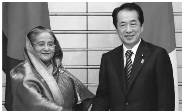
Getting acquainted: Bangladesh Prime Minister Sheikh Hasina meets Prime Minister Naoto Kan during her stay Nov. 29, 2010, at the official residence in Tokyo.

ther of the Nation. Joi Bangla, Joi Bangabandhu, May Bangladesh Live Forever