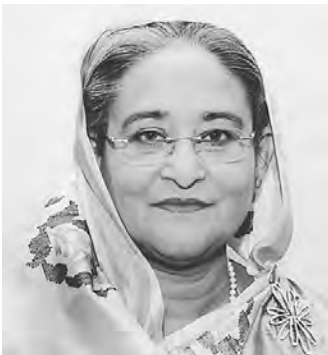
Sheikh Hasina PRIME MINISTER, THE PEOPLE'S REPUBLIC OF BANGLADESH

galee of all time, Father of the Nation Bangabandhu Sheikh Mujibur Rahman. I also pay my humble tribute to the four national leaders — Tajuddin Ahmed, Syed Najrul Islam, Capt. M. Monsur Ali and A.H.M. Kamrujjaman — who led the war under the directive of Bangabandhu. I pay homage to the valiant freedom fighters, and my sincere sympathies go to the wounded war veterans.