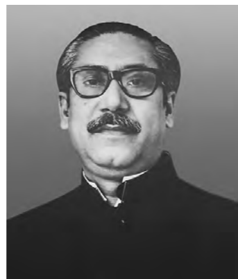
Father of the Nation Bangabandhu Sheikh Mujibur Rahman

to establish Bangladesh as a poverty-, hunger- and illiteracy-free, progressive and democratic country by 2021, the Golden Jubilee of our independence.