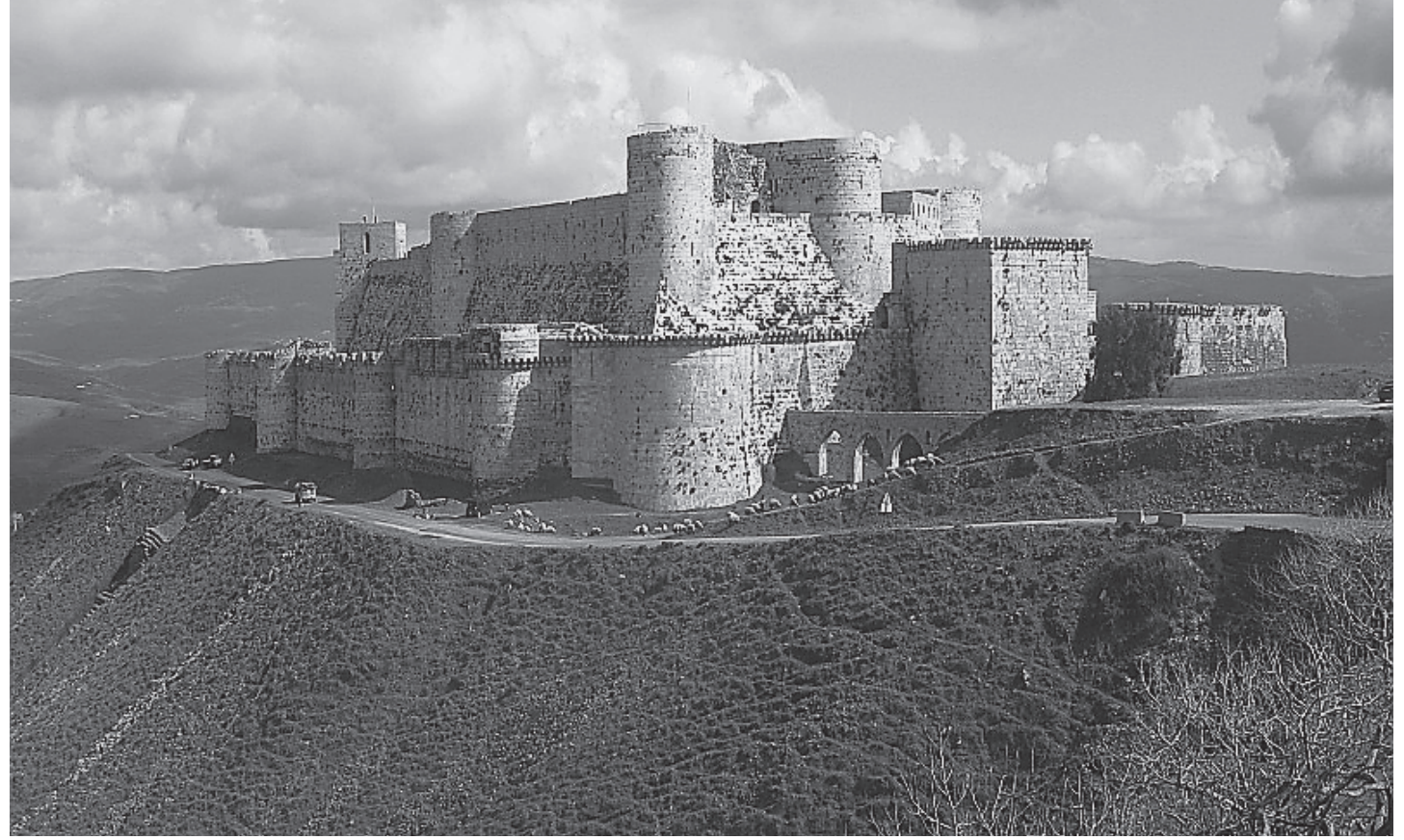
Crac des Chevaliers: A crusader castle located close to the border with Lebanon, the fortress is one of the most important preserved medieval sites in the world.