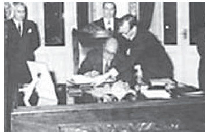
Close ties: A Japan-Paraguay Immigration Agreement was concluded in 1959.

Lastly, as ambassador of the Republic of Paraguay in Japan, I would like to extend my gratitude to the Japanese government and people for their hospitality and support. I am very happy to be able to celebrate the bicentennial Anniversary of our Independence Day together with my fellow Paraguayan citizens who live in Japan alongside our Japanese friends, and share the joy and depth of our friendship and respect, especially during these difficult times in our host nation.