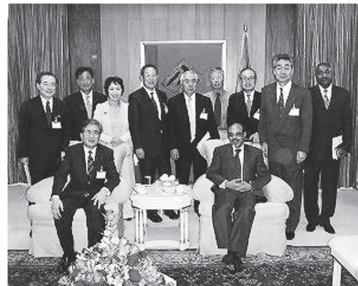
Close ties: Prime Minister Meles Zenawi (front row, right) meets the Keizai Doyukai (Japan Association of Corporate Executives) Africa Committee delegation during the group's visit to Ethiopia in March 2011.

Harnessing more reliable and clean energy is one of the GTP targets. The launching of the Renaissance Dam on the Nile River, which will generate 5,250 megawatts, will play a key role in transforming the Ethiopian industrialization process. Ethiopia also welcomes all kinds of cooperation that enhance fair and equitable utilization of trans-boundary waters to improve the livelihoods of the people around those areas, including the Nile.