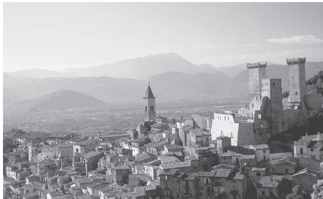
Setting of hope: The village of Pacentro near L'Aquila in Abruzzo, which was struck by a devastating earthquake in 2009, was a location for the film "The American" (starring George Clooney and opening July 2 in Japan), which aims to help the region recover.

"This year, we want these autumn events to be particularly cheerful. We want to participate