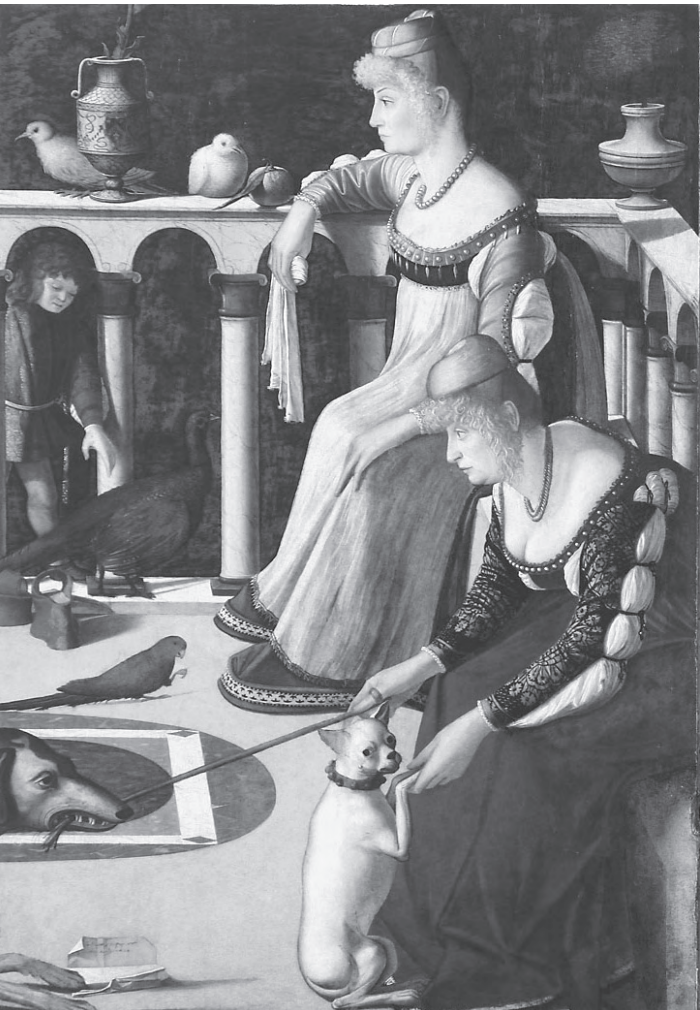
Two Venetian Ladies: "Due dame Veneziane," a painting made around 1495 by Vittore Carpaccio, will be on display at the Edo-Tokyo Museum during the exhibition "Portrait of Venice — A Thousand Years of History," from Sept. 23 to Dec. 11.