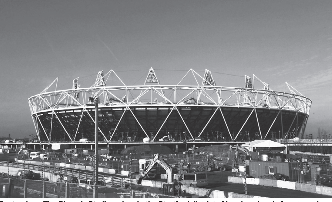
Centerpiece: The Olympic Stadium rises in the Stratford district of London ahead of next year's Summer Olympics. The park where it stands will be named after the queen in 2013.

In the next 12 months, Her Majesty will look forward to a year of continuing celebrations, beginning with her Diamond Jubilee, celebrating 60 years on the throne, and in July 2012, the opening of the London Olympics, a celebration that the United Kingdom will share with the whole world. The Olympics are of course a festival of sport but also an opportunity to display the diversity of modern British life. They have been designed to provide a lasting legacy for the Olympic Park's host community of Stratford in East London the most diverse in Europe, with over 300 languages spoken. The park itself, which is the largest of its kind to open in Europe for generations, will become the