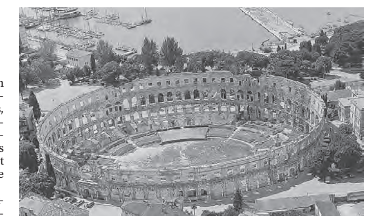
Amphitheater: Pula Arena, constructed between 27 B.C. and A.D. 68 in the ancient Roman colonial city of Pula, is among the largest such structures surviving today.

In conclusion, allow me to express my gratitude to The Japan Times for providing me with an opportunity to address hereby its respected readers. Allow me to once again wholeheartedly congratulate all Croatian citizens residing in Japan, as well as all our friends from Japan and around the world who hold Croatia dear, on the 20th Statehood Day of Croatia.