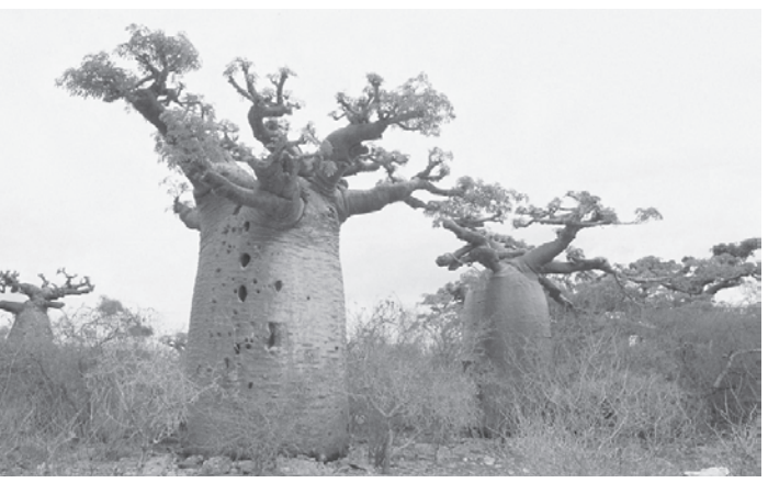
Unique tree: Six out of the eight species of baobab in the world are endemic to Madagascar and all six are threatened or nearly threatened by extinction.

Art from nature: A baobab and the award-winning ring-tailed lemur wood carvings by laly Venance