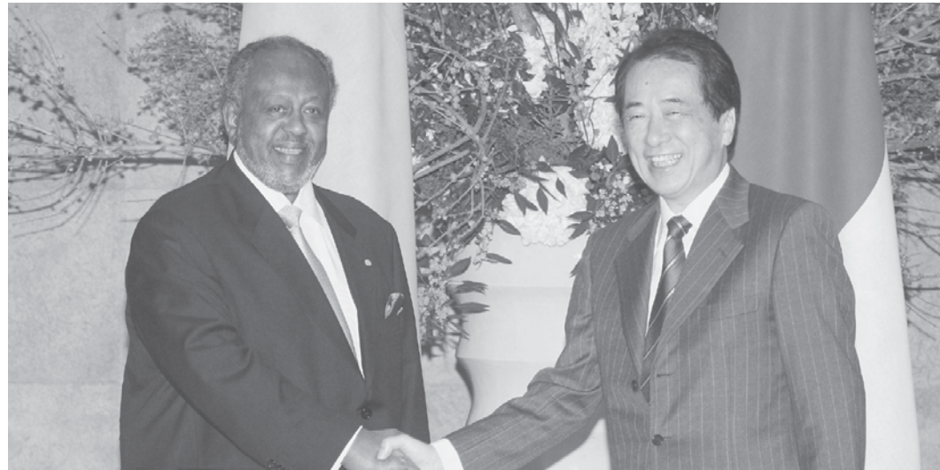
Friendly ties: Djibouti President Ismail Omar Guelleh meets Prime Minister Naoto Kan in Tokyo on Dec. 20.