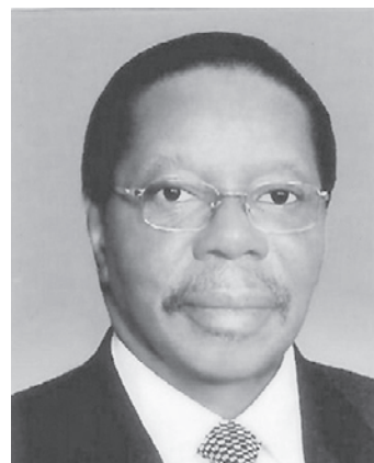
H.E. President of Malawi Bingu wa Mutharika

The government also recognizes the importance of education and realizes that children are the future leaders of tomorrow.