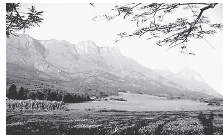
Breathtaking: Located in southern Malawi, the massive Mount Mulanje takes up an area approximately 22 km by 26 km, with a maximum elevation of around 3,000 meters at its highest point, Sapitwa Peak.

wi boasts a large number of skilled and abundant labor, a conflict-free country, a good climate, investor-retaining policies, tax holidays and many more incentives to smooth the setting up of business. Malawi also has easy access to world gateway points from Africa.