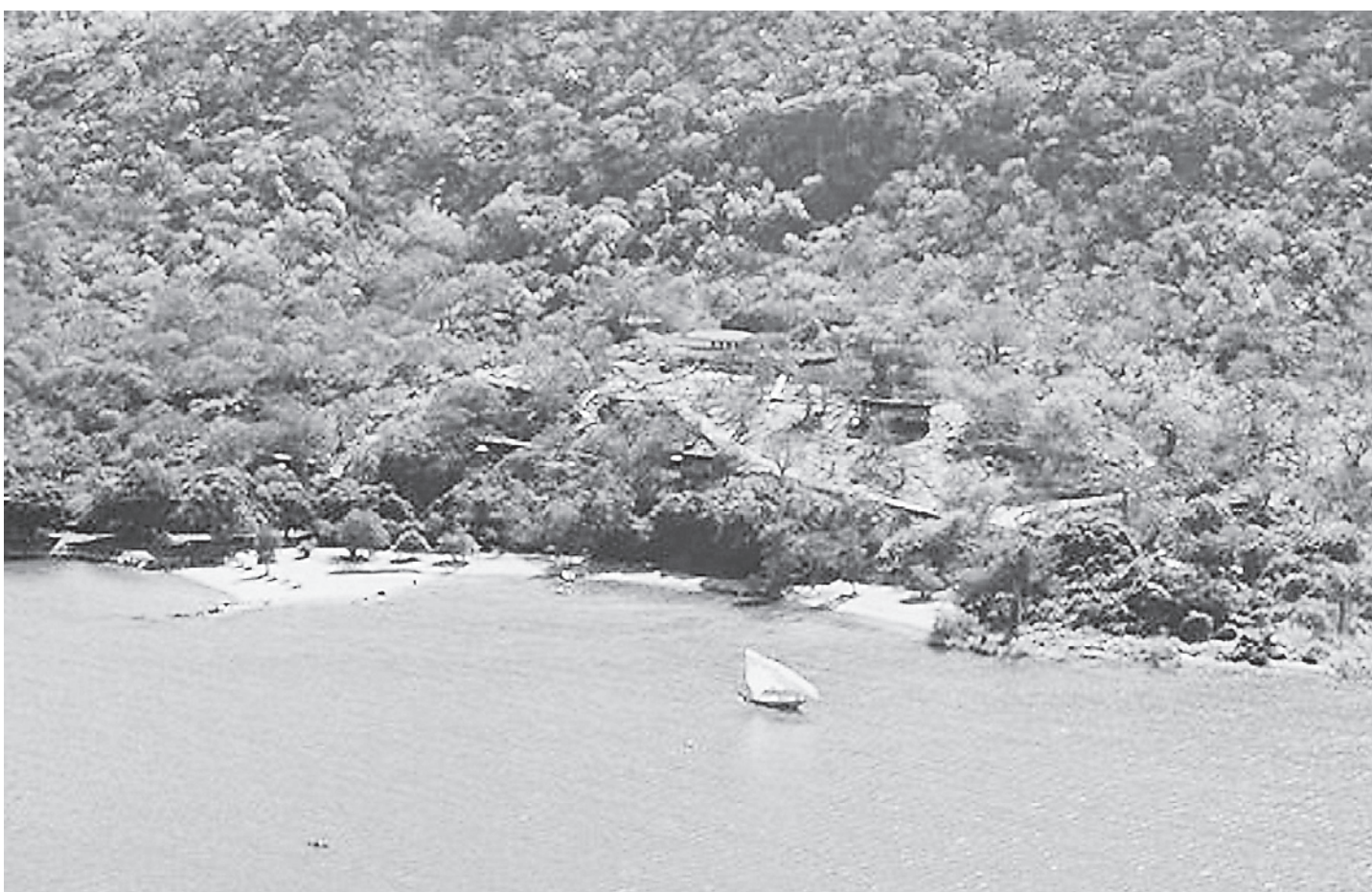
Vast: Lake Malawi is the southernmost lake in the Great Rift Valley system of East Africa, the third largest in Africa and the eighth largest in the world. Many species of fish inhabit the lake, providing nearby residents with a major food source. EMBASSY OF MALAWI

International Division: 2-32-22, Higashi-Ikebukuro, Toshima-ku, Tokyo 170-0013, Japan Phone: +81 3 5956 4811 Fax: +81 3 5951 1771 http://www.dnc.co.jp/en/