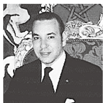
King Mohammed VI

Today, more than five months after the disaster, I am happy to note that, thanks to the strong spirit of the Japanese people, which I truly admire and respect, and the support of the