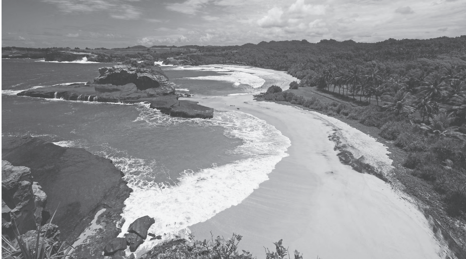
Attraction: Klayar Beach in the Pacitan area of Java has white sand amid the blue sea and lush mountains. MINISTER OF CULTURE AND TOURISM

Indonesia could minimize the impact of the 2008 global economic crisis. With a robust economic growth and a good economic posture, Indonesia is