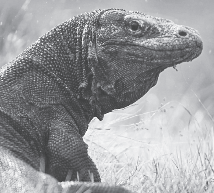
Wildlife: The Komodo dragon is native to Indonesia and is the largest lizard in the world. MINISTER OF CULTURE AND TOURISM

Congratulations to the People of the Republic of Indonesia on the 66th Anniversary of Their Independence