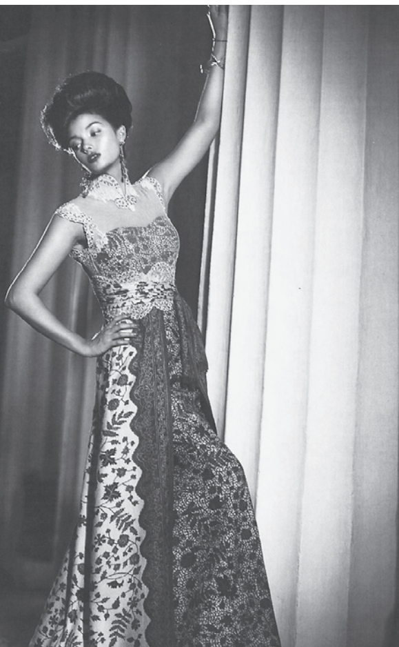
Traditional art: Special dyes and patterns combine to create batik cloth. BATIK DANARHADI

Looking at the state of the current bilateral relationship, I am confident that Indonesia and Japan will have stronger bonds if we can play a constructive role for a peaceful and prosperous regional and global order.