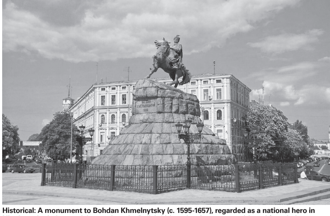
Ukraine who led an uprising against the Polish-Lithuanian Commonwealth and founded a Cossack state, is in the center of the capital Kiev.

In its foreign policy, Ukraine pays special attention to its relations with the United States. Our country counts on cooperation with the U.S. in bilateral issues, such as the needed support for reforms, and global ones, such as the fight against terrorism, drug trafficking and other crimes. Washington is interested in cooperation with Kiev in the energy field, specifi-