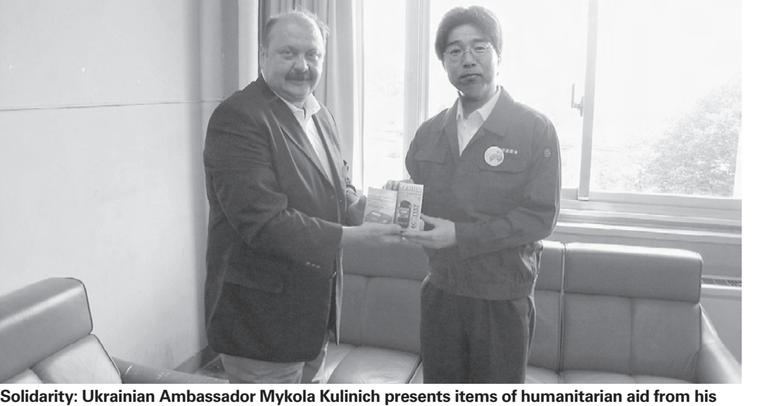
country to Kaname Tajima, vice minister of economy, trade and industry, in Fukushima City on

Touching upon the recent trends in Ukrainian-Japanese relations, we cannot but speak about the dramatic events that occurred in Japan in March as a result of the powerful earthquake, the devastating tsunami and the accident at the nuclear CONTINUED ON PAGE 7