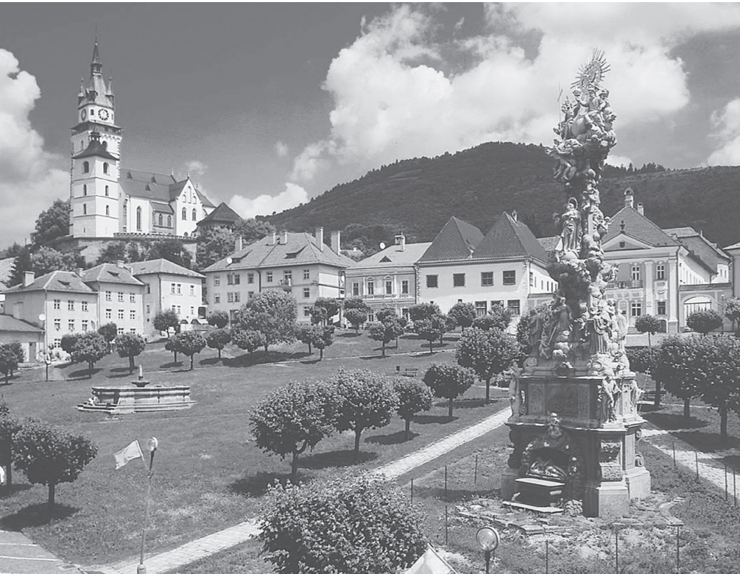
Historic: Located in central Slovakia, Kremnica is a well-preserved medieval town, which was among the major gold mining centers in the Middle Ages, and its mint is the oldest operating in the world. EMBASSY OF SLOVAKIA

Group) plus Japan. In June, the Meeting of Ministers of Foreign Affairs of the V4 plus Japan was held successfully under Slovakia's V4 presidency. An Energy Saving Seminar was also organized under the framework. As for the economic field, a number of Japanese companies have been operating in the Slovak Republic and it is expected that the economic relationship between both countries will deepen even further.