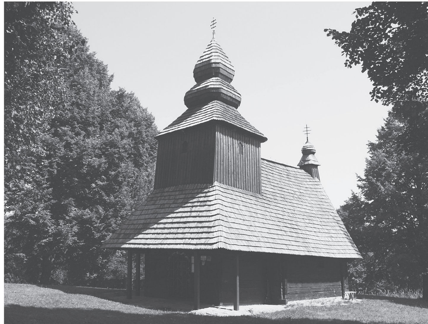
Sacred structures: Slovakia is home to a number of wooden churches, such as the St. Nicholas Church (above), a UNESCO World Heritage site in Ruska Bystra, and the St. Paraskieva Church in Dobroslava (below left). The St. Matthew Church in Zolna (below right) is an example of late Romantic-early Gothic architecture.

Today, the relationship between Japan and the Slovak Republic has developed in a wide range of areas. Based on common and fundamental values such as democracy and the rule of law, Japan and Slovakia are tackling global issues together. Furthermore, both countries also cooperate closely in the framework of the V4 (Visegrad