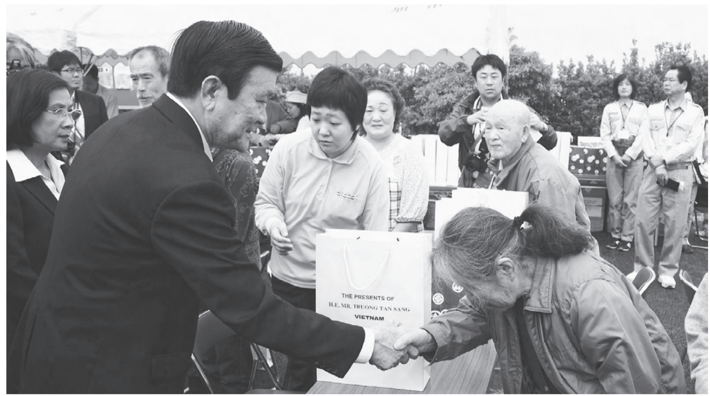
Solidarity: H.E. President Truong Tan Sang, at the time a top party leader, consoles people affected by the Great East Japan Earthquake in the city of Asahi, Chiba Prefecture, on June 3.

Vietnam also offers a wide range of opportunities for Japanese companies in various sectors, including mining, banking, energy development, power generation and food processing. The modality of public-private partnerships (PPP) recently launched by the Vietnamese government has attracted and would well serve as the pipeline for a greater contribution of the Japanese private sector to large