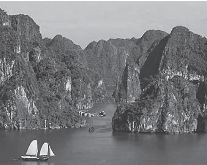
Natural beauty: Located in northeastern Vietnam, Ha Long Bay is a UNESCO World Heritage site and a popular tourist destination.

than expected. In 2013, Vietnam and Japan will commemorate the 40th anniversary of the establishment of their diplomatic relations. This time will be a great, joyful occasion for our two peoples as the cooperation between the two nations, after every stage of evolution over the past years, has expanded to a great extent and developed to the depth of strategic substance. With the formation of a new government in Vietnam in early August, the official visit to Japan by the current prime minister of Vietnam, H.E. Nguyen Tan Dung, which is expected to happen in the last months of 2011, would be of utmost importance to enforce more powerful momentum to further consolidate and strengthen the close and friendly relationship between our two countries.