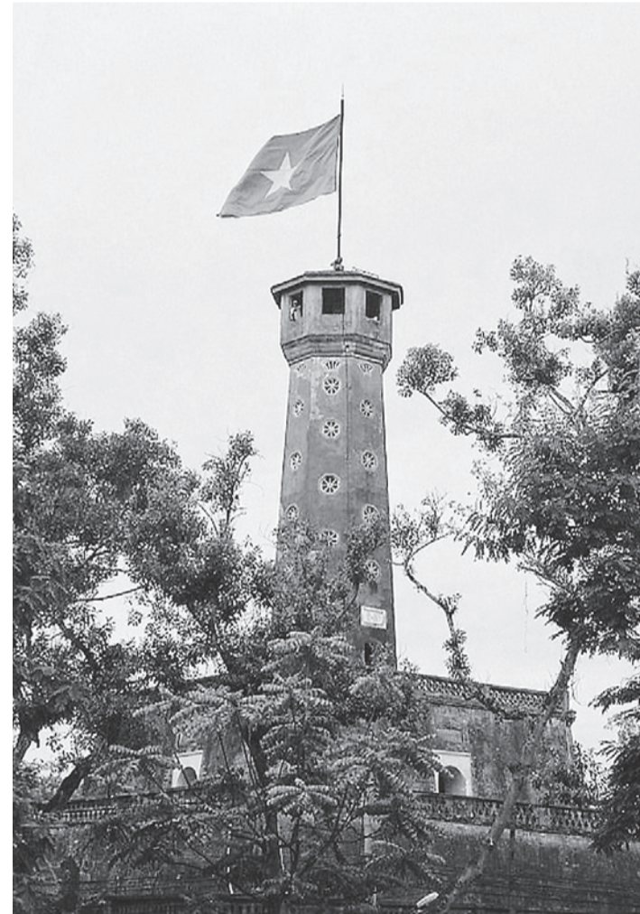
Symbol: The Hanoi Flag Tower, part of the Thang Long Imperial Citadel complex, was completed in 1812 and is one of the most widely recognized landmarks in Hanoi. EMBASSY OF VIETNAM