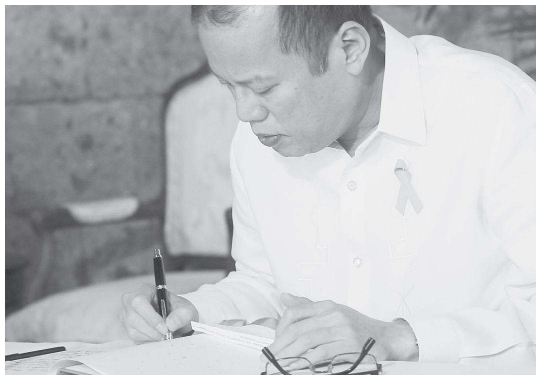
Solidarity: Philippine President Benigno S. Aquino III signs the Book of Condolences for the victims of the March 11 earthquake and tsunami that hit northeastern Japan at the Japanese ambassador's residence in suburban Makati, east of Manila, on March 17.

As Japan continues to deal with the challenges of reconstruction in the wake of the Great East Japan Earthquake, the president's visit serves as another concrete occasion to renew the solidarity of the people and government of the Philippines with the Japanese people and government. The resilience, fortitude and unity of the Japanese people