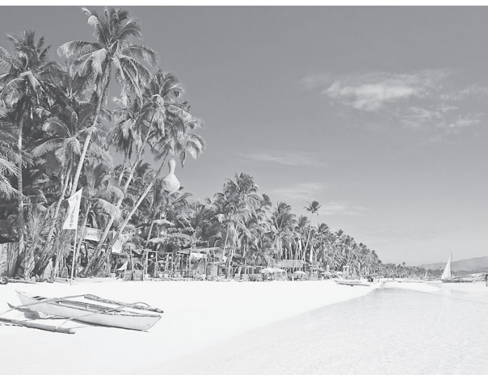
Natural attractions: The Philippines is an archipelago of many beautiful beaches, such as the white sands in Boracay, and fascinating scenery such as the Chocolate Hills (below) in Bohol. PHILIPPINE EMBASSY

The Philippine Tourism Authority has in fact been reorganized into the Tourism Infrastructure and Enterprise Zone Authority (TIEZA), a corporate body whose mandate includes the designation and administration of special areas devoted to tourism-related projects, known as tourism enterprise zones (TEZs), in the mold of special economic zones.