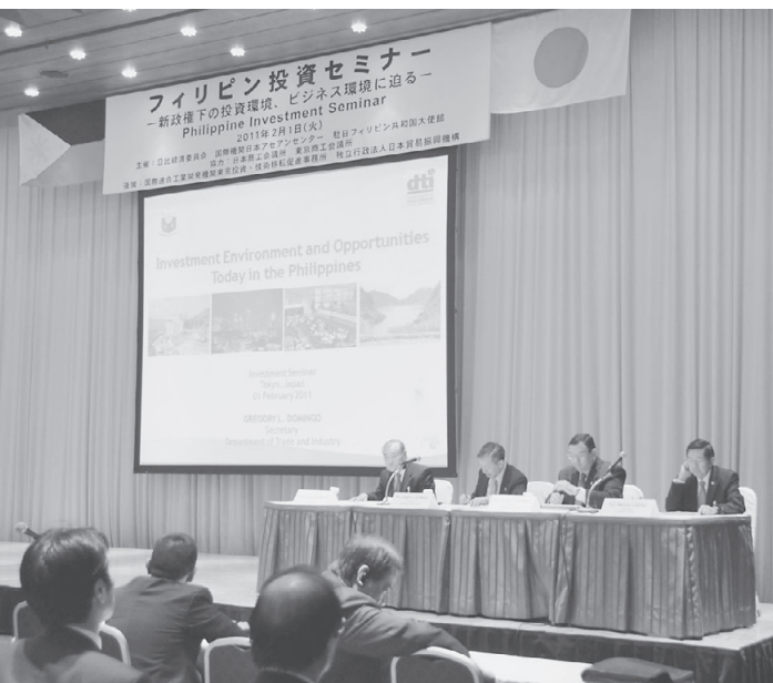
Economic ties: A Philippine Investment Seminar in Tokyo on Feb. 1 informs the Japanese business community of the investment environment and opportunities under the administration of President Benigno S. Aquino III, encouraging firms to continue to take part in the country's resurgence.

The president is meeting the Filipino community in Tokyo as well as Filipino nationals and locals in Ishinomaki, Miyagi Prefecture, one of the cities most severely affected by the March 11 earthquake and tsunami.