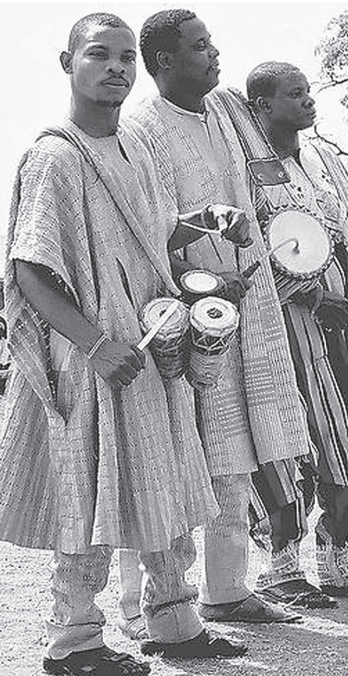
Nigerian music: These drums, traditionally made from a single piece of wood or spherical calabashes, are the most common type of percussion instrument in Nigeria.

I once again congratulate Nigeria for all of its achievements thus far and hope that Nigeria will continue to play a leading role in the overall development of Africa.