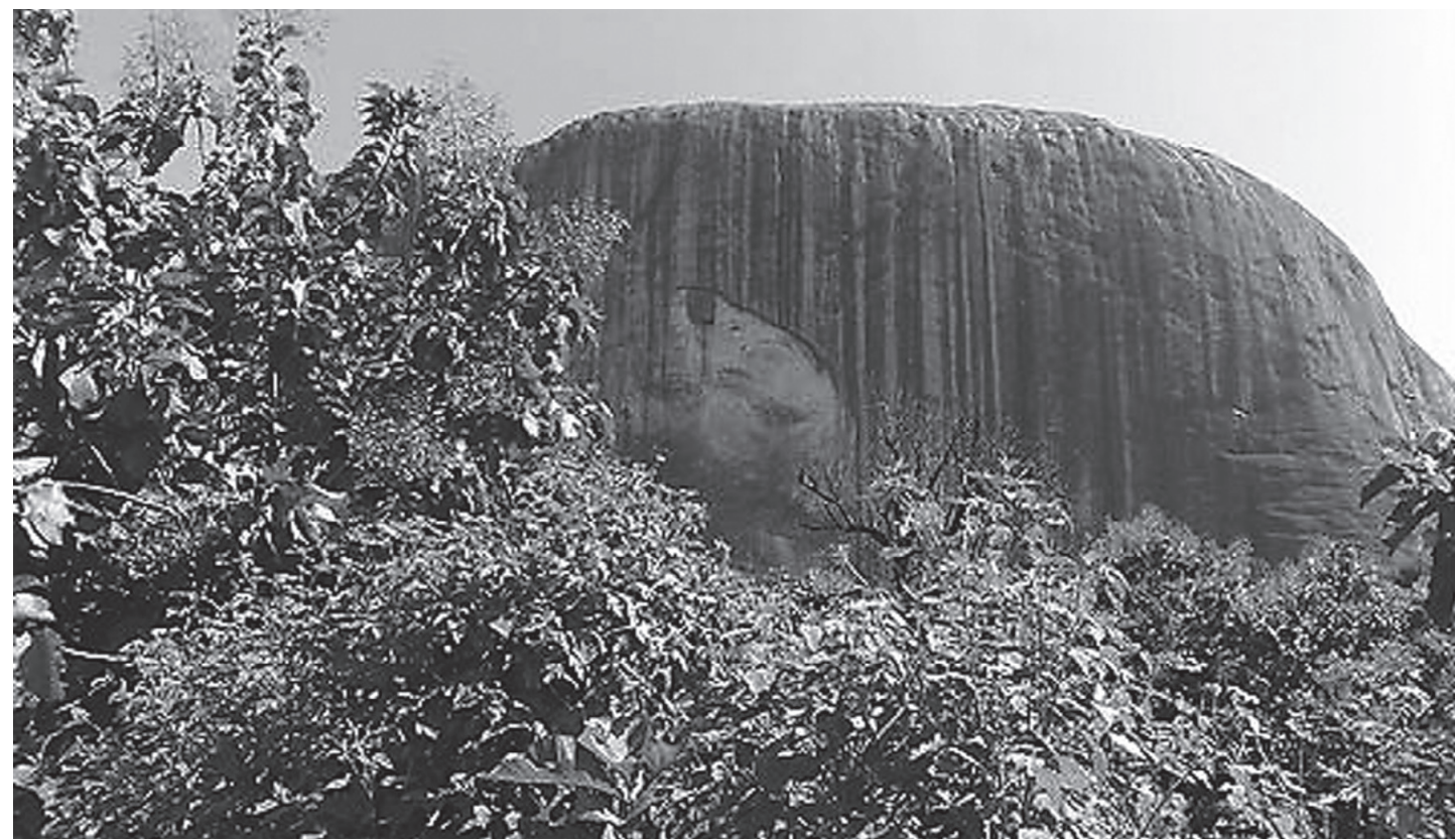
Natural wonder: The monolith Zuma Rock rises in Niger State, 725 meters high, towering above the surrounding area, and is often called the "Gateway to Abuja."

That Nigeria made remarkable economic progress in 2010 has been partly due to support it has received from the government of Japan and other friendly countries. Indeed, Japan was Nigeria's 28th largest export trading partner both in 2009 and 2010. The value of Nigeria's exports to Japan increased from $2.22 billion in 2009 to $3.8 billion in 2010, representing an increase of 71.06 percent. In terms of im-