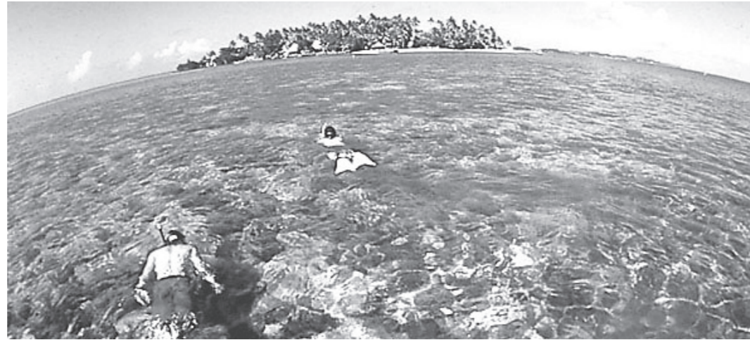
Ocean life: Fiji is a paradise for marine sports such as sailing, fishing, swimming, snorkeling and scuba diving.

The ODA policy to Fiji is basically in line with Japan's General Assistance Plan for the Pacific Region. While there are three vital components of the ODA program, i.e. grant aid, technical cooperation and loan aid, current principal components that are practicable for Fiji are technical cooperation and grant aid for basic human needs.