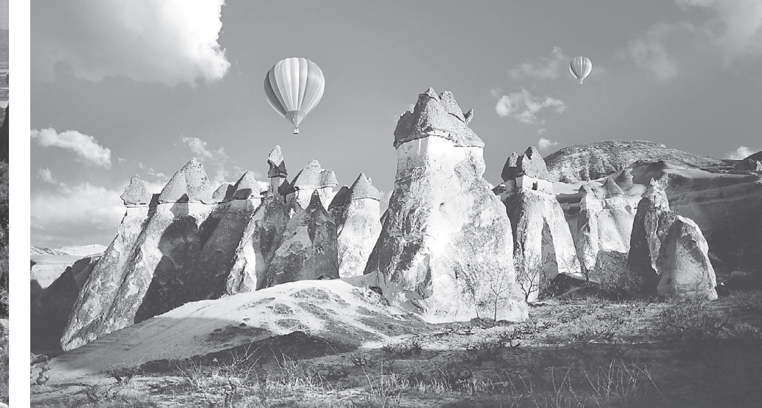
Natural wonders: The rock sites of Cappadocia are a popular tourist destination due to the unique geological, historic and cultural features, such as the "fairy chimneys" formation near Goreme. TURKISH EMBASSY OFFICE OF THE CULTURAL AND INFORMATION COUNSELOR