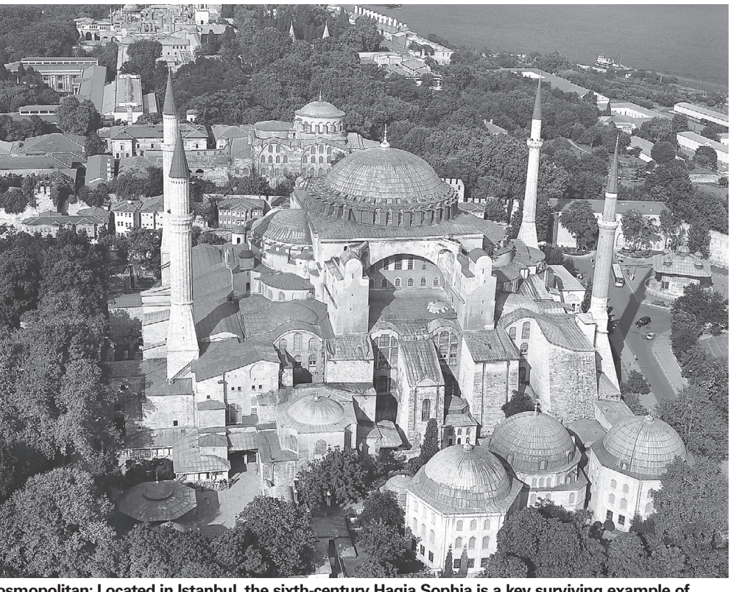
Cosmopolitan: Located in Istanbul, the sixth-century Hagia Sophia is a key surviving example of Byzantine architecture. Once a cathedral, later a mosque, the UNESCO World Heritage site is now a museum. TURKISH EMBASSY OFFICE OF THE CULTURAL AND INFORMATION COUNSELOR

In this regard, I would like to take this opportunity to announce the forthcoming Turkey-Japan Economic Forum, which will be held on Dec. 5 in Tokyo, with the participation of H.E. Ali Babacan, deputy prime minister for economic and financial affairs of the Republic of Turkey. I hereby invite Japanese businessmen to this forum, which will help to increase economic exchanges between the business communities of the two