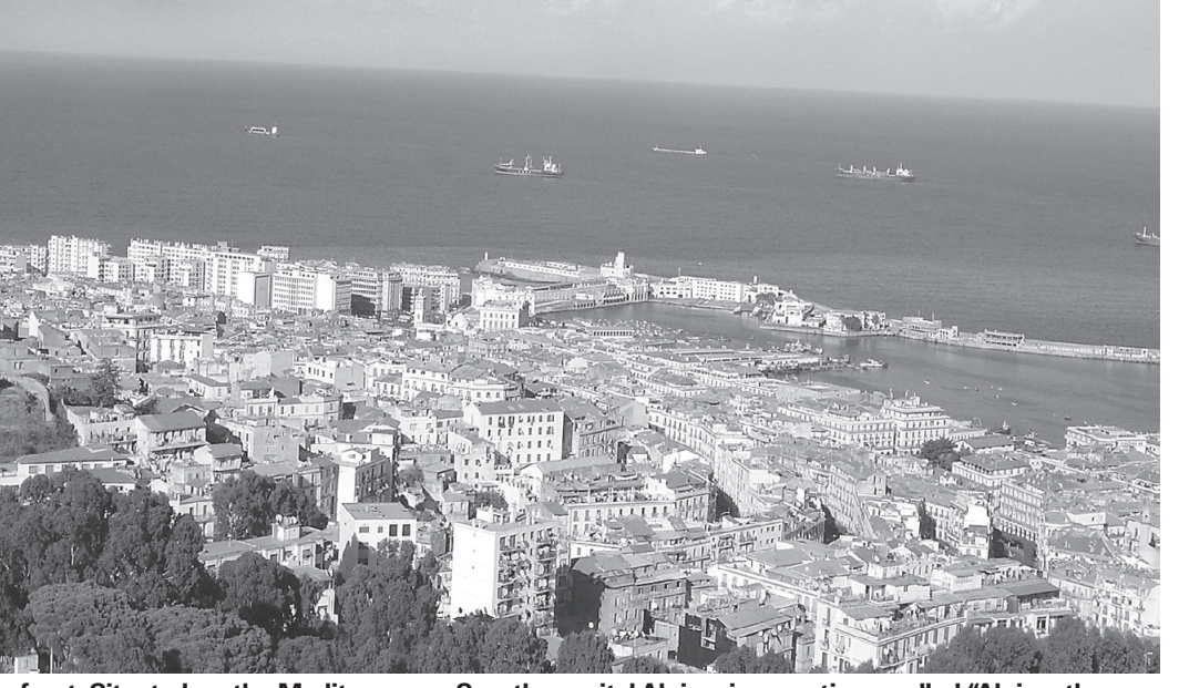
Seafront: Situated on the Mediterranean Sea, the capital Algiers is sometimes called "Algiers the White" for the bright facades of its buildings, especially when seen from the sea.

That initial, though informal, step in the forging of Algeria-Japan friendship paved the way