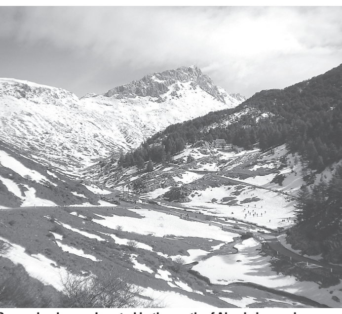
Snowy landscape: Located in the north of Algeria is a major tourist destination, the Djurdjura National Park, which also has a

We are convinced of the importance of the special relationship between our nations.