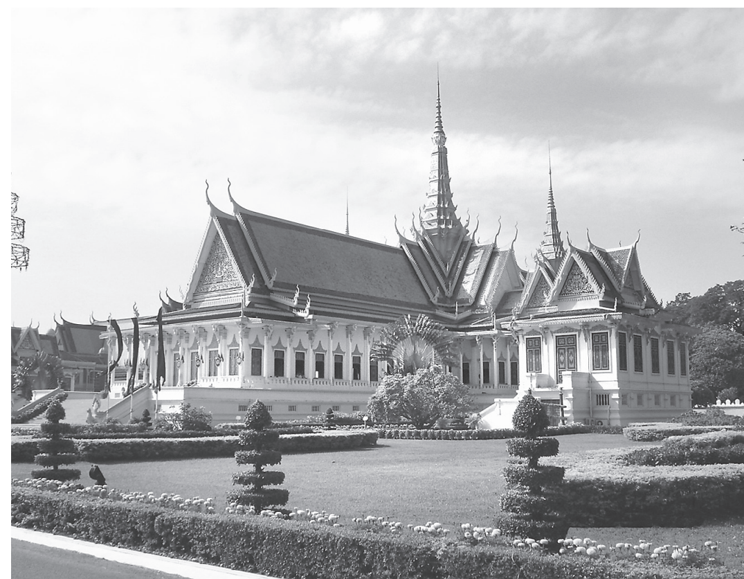
Capital landmarks: The Royal Palace is the residence of His Majesty the King of Cambodia, and Wat Phnom (below) is a Buddhist temple that is a symbol of Phnom Penh.

I sincerely hope that Japan and Cambodia, as members of the Asian community, will further strengthen the mutual trust and friendship, and work together to achieve peace and prosperity in Asia as a whole.