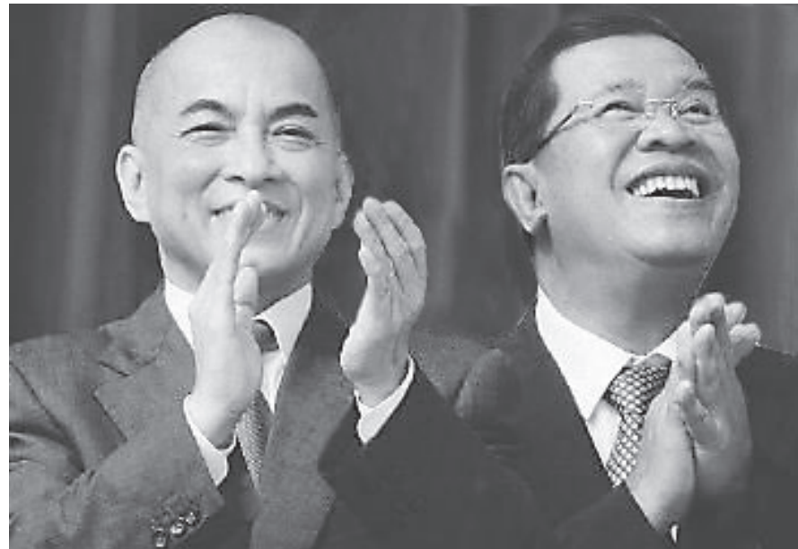
National leaders: His Majesty King of Cambodia Norodom Sihamoni (left) and Prime Minister of Cambodia Hun Sen; Right: The 20th anniversary of His Majesty King-Father Norodom Sihanouk's return to Cambodia is celebrated in October.

In fact, 20 years have passed since the Agreements on a Comprehensive Political Settlement of the Cambodia Conflict, known as the Paris Peace Accords, were signed by Cambodia and 18 other nations, including Japan, on Oct. 23, 1991, in Paris. It marked the first time that Japan's Self-Defense Forces were dispatched outside the country, within the framework of the United Nations Peacekeeping Operation, since the end of World War II. The conclusion of the agreements brought hope for the Cambodian people to enjoy the rights to live in peace for a prosperous future after enduring more than 20 years of war. Unfortunately, the agreements did not bring immediate full peace for the Cambodian people. The country's peace and stability remained fragile due to the Khmer