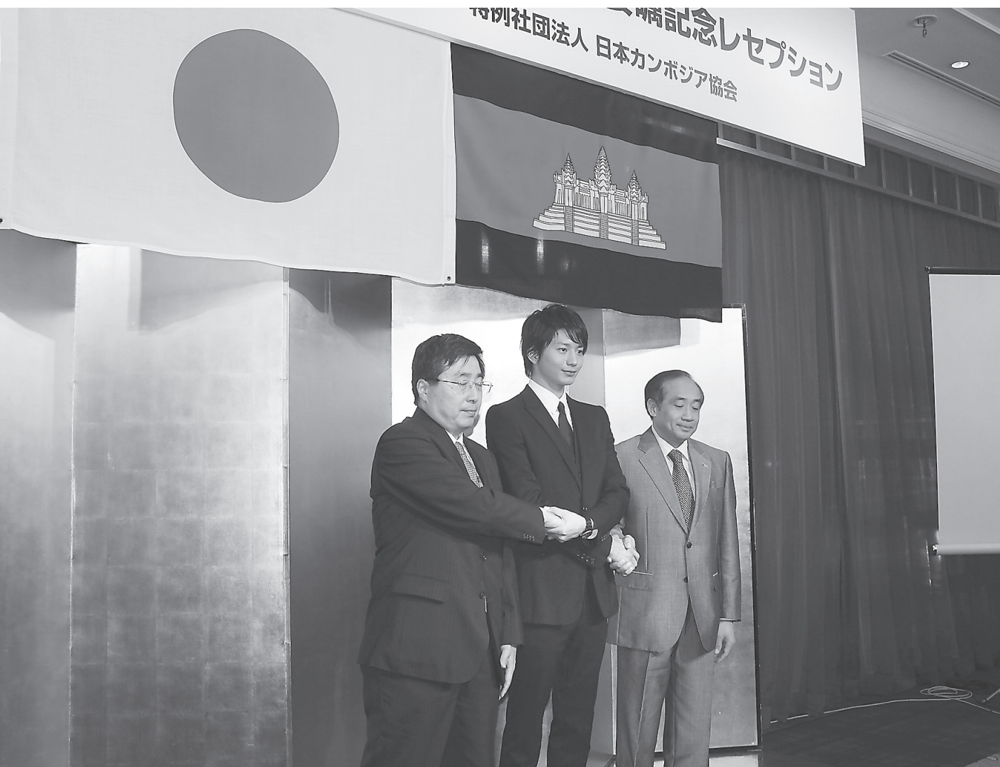
Friendship: Actor Osamu Mukai (center) has been designated by Japan as goodwill ambassador to Cambodia.

Congratulations to His Majesty King-Father NORODOM SIHANOUK on His 89th Birthday and to the People of the Kingdom of Cambodia on the 58th Anniversary of Their Independence Day