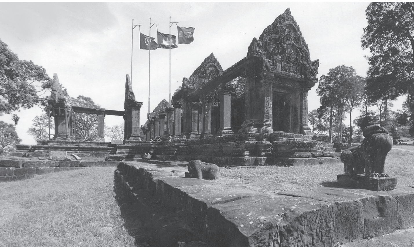
National pride: The Temple of Preah Vihear has been listed as a UNESCO World Heritage site since 2008. ROYAL EMBASSY OF CAMBODIA