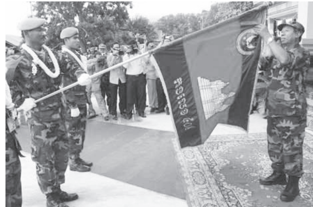
Global contribution: Cambodia's military personnel is dispatched to support United Nations Peacekeeping Operations. ROYAL EMBASSY OF CAMBODIA

in 2002. Cambodia, as chair of ASEAN, in close cooperation and with the support of all member countries, will continue to work on ASEAN's current priorities to push forward a dynamic integration toward realizing the ASEAN Community by 2015.