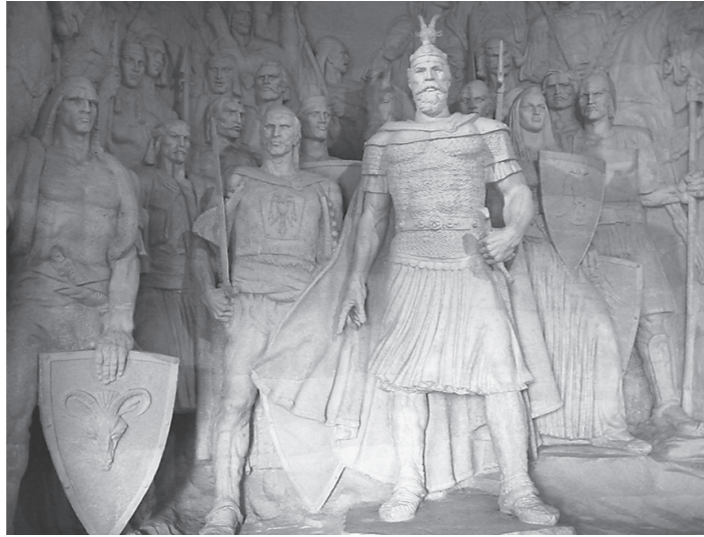
National hero: George Kastrioti Skanderbeg (1405-1468) is the most important figure of the Albanian National Awakening.

Firstly, I would like to express one more time the heartfelt condolences to the people of the Tohoku region, who faced on March 11 one of the biggest natural disasters in history. The prayers and thoughts of the Albanian people rest with the victims and their families. And yet, it was the determination and unparalleled resilience of the Japanese people, who did not succumb to the extreme difficulties, but managed to overcome the worst. From my visit to the Tohoku area, I noticed not only the wreckages of the devastation