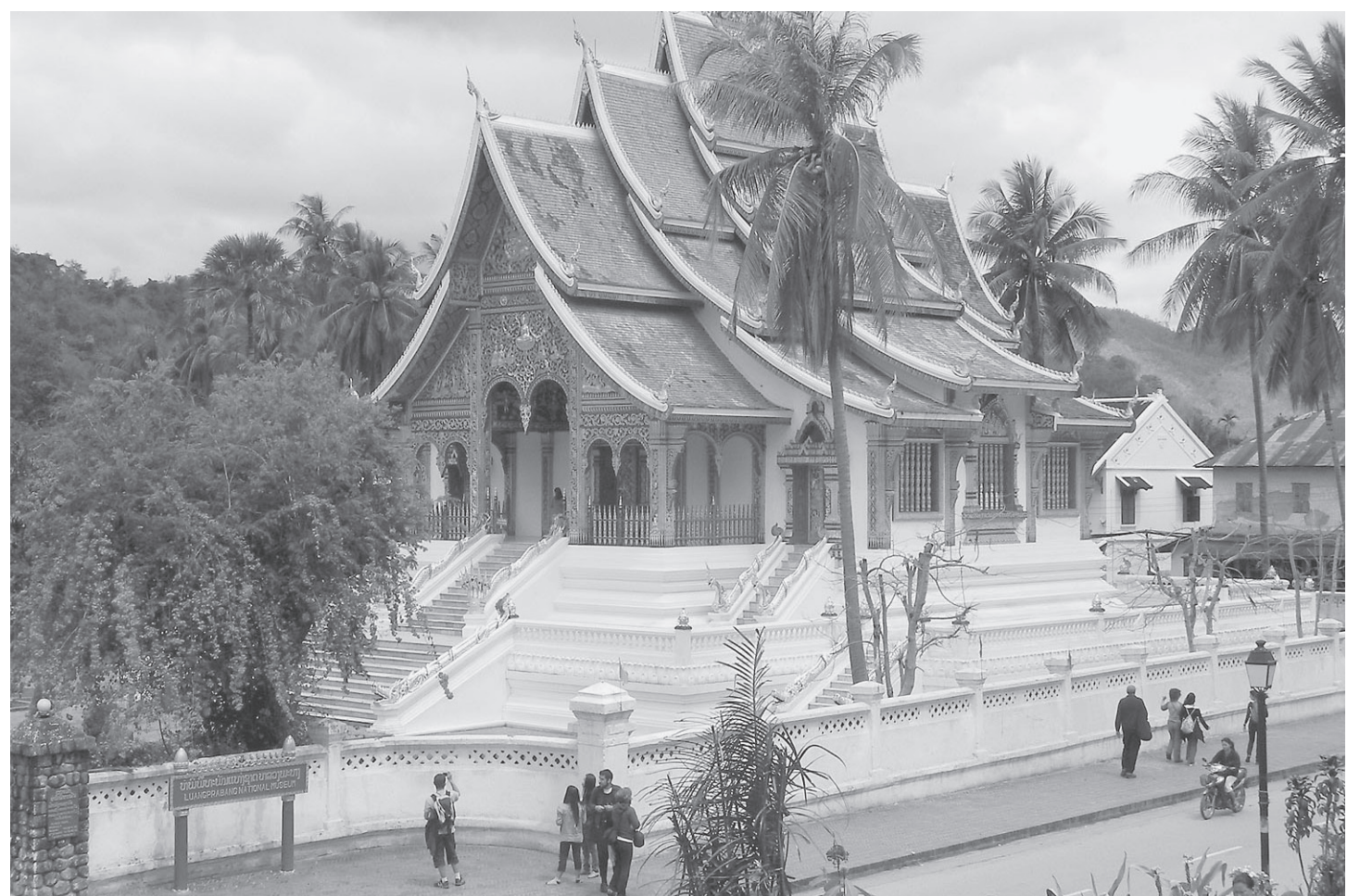
Majestic: Located in north-central Laos on the Mekong River, Luang Prabang, once the capital of the Lan Xang kingdom (14th to 18th century), has been a UNESCO World Heritage site since 1995.

Even though Japan had been seriously affected by the March 11 disaster, the Japanese government kept its continuation of assistance and support to the Lao PDR. During the visit of Deputy Prime Minister Thongloun in August, the government of Ja-