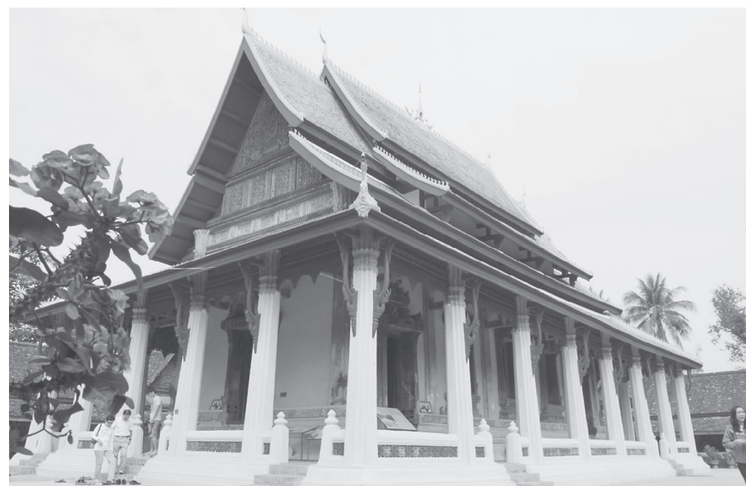
Worship: Built in 1818 on the orders of King Anouvong, Wat Si Saket is a Buddhist monastery temple in Vientiane.