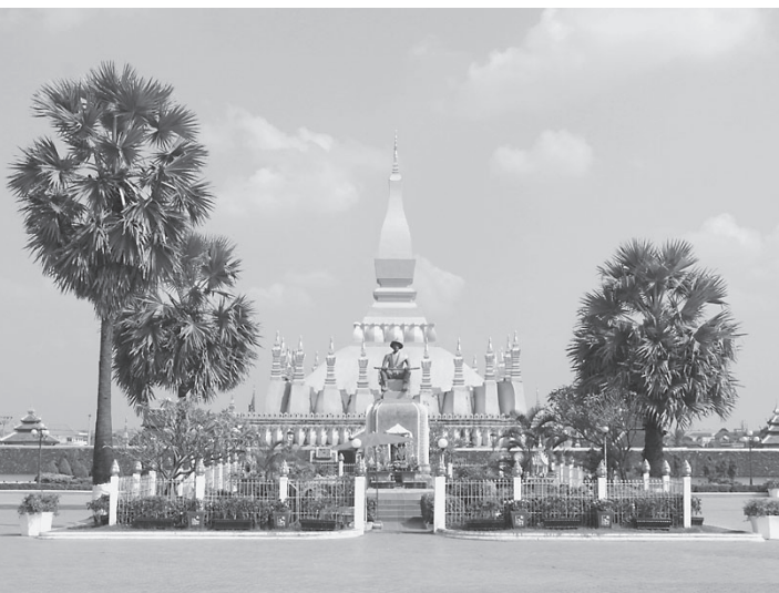
Shining: Covered in gold leaf, the Pha That Luang stupa stands in the center of Vientiane.