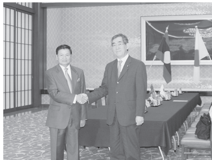
Friendly ties: Thongloun Sisoulith, deputy prime minister and foreign minister of Laos, meets with then Foreign Minister Takeaki Matsumoto in Tokyo during his visit to Japan in August.

The year 2011 is of great significance for the Lao people as the government evaluated the implementation of the sixth, five-year National Socio-Economic Development Plan (NSED) and set up the seventh NSED for 2011-2015, and the ninth Congress of the Lao People's Revolutionary Party and the general election of the seventh National Assembly were held successfully,