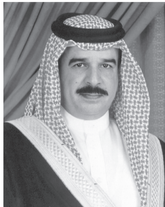
His Majesty King Hamad bin Isa Al Khalifa of Bahrain

Finally, the team at the Embassy of the Kingdom of Bahrain to Japan would like to express our gratitude to His Majesty King Hamad bin Isa Al Khalifa, His Royal Highness Prime Minister Prince Khalifa bin Salman Al Khalifa and His