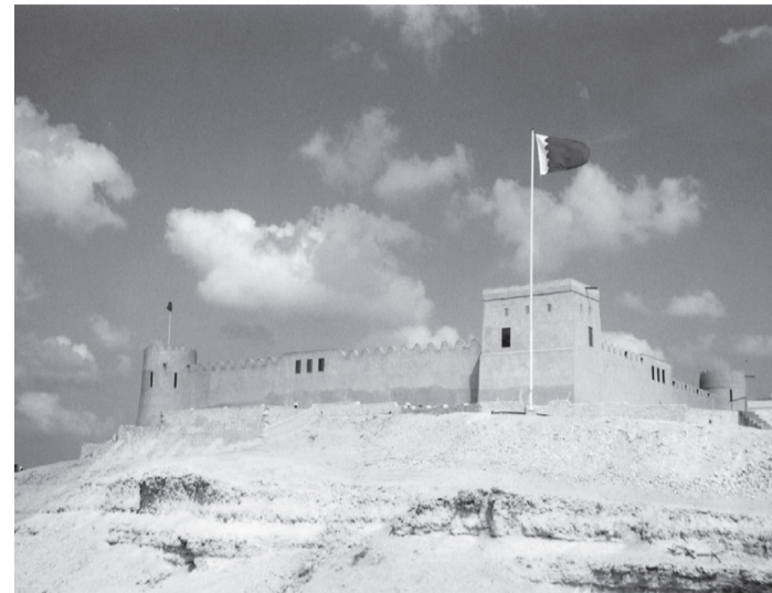
Modern and traditional: The Bahrain World Trade Center (right) in the capital Manama includes office towers, shopping malls and a five-star hotel; above, the Sheikh Salman bin Ahmed Al Fateh Fort built in 1812 in Riffa, Bahrain's second largest city, is a major tourist attraction.

Trading accounts of the Sumerians from 3000 B. C. remain in a land called Dilmun, the first mention of Bahrain's oldest recorded civilization. Dilmun was one of the great trading empires and a major center on the trade route between Mesopotamia and the Indian subcontinent. Today, the Kingdom of Bahrain is the venue of choice for international investors looking to establish their operations in the Middle East. A globally oriented country with a distinctly local flavor, Bahrain has witnessed leaps and bounds in its development in the past four decades. Having established itself as the undisputed financial center of the Gulf region, and moving toward becoming the region's knowledge-based service hub, Bahrain's progressive outlook and international perspective are reflected in its social and economic diversity.