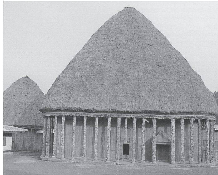
Original: The chief's compound in Bandjoun is among the Bamileke people's impressive buildings.