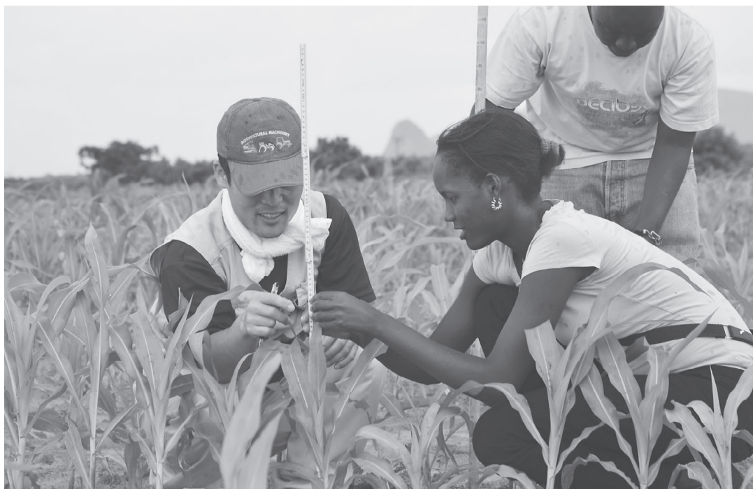
Collaboration: Mozambican and Japanese researchers work together in a field in Nampula Province under the framework of the ProSAVANA Program.