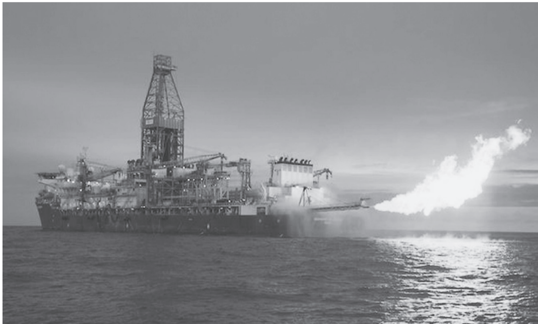
Potential: A successful flow test is conducted at a large-scale liquefied natural gas project off the coast of Mozambique. Right: Pemba beach has developed into a major tourist destination for divers and those who enjoy water sports.

accelerate growth and development. But for that, the first and most important element is that they should be explored in a sustainable manner. It is also important that these resources do not transform Mozambique into a mere producer and exporter of primary goods. Value addition is paramount since it leads not only to industrialization but also to job creation and technology transfer,