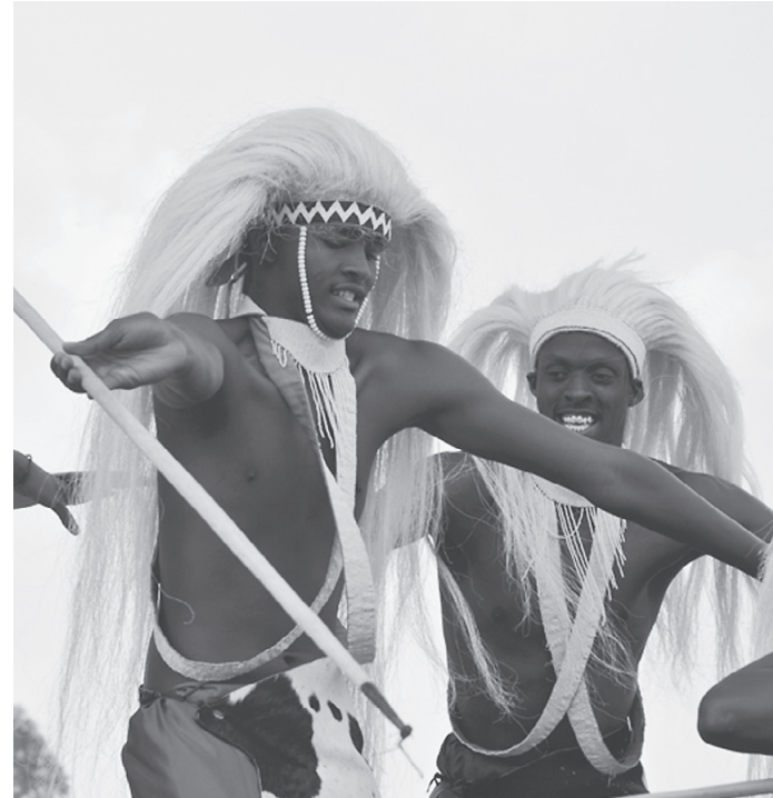
Traditional and modern: Dance plays an important role in the traditions of the Rwandan people. Right: Opened in 2011, Kigali City Tower is a 20-story skyscraper that contributes to the redefining of Kigali as a thriving, modern capital filled with possibilities.

As mentioned in the beginning, this year also marks the