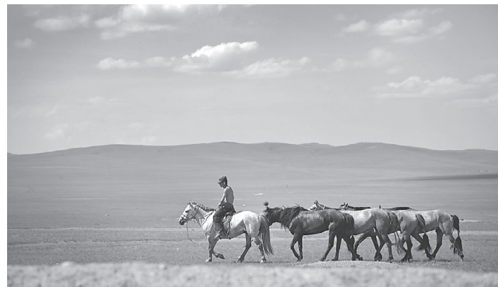
A horseman prepares his racehorses on July 3 for the July 11 to 13 Naadam festival on the grasslands of Tov Province, southwest of Ulan Bator, while Mongolian honor guards (top) prepare national flags during a July 9 rehearsal for a military parade for the Naadam festival in front of the Parliament Building at Sukhbaatar Square in the capital Ulan Bator.

The ruling Mongolian People's Party (MPP) and the main opposition Democratic Party (DP) both say they want to ensure a fairer distribution of wealth in the vast and remote nation, although neither has given any detailed indication of how this will be achieved.