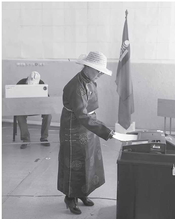
National determination: A woman inserts her ballot into an electronic vote-counting machine in Tov Province during the Mongolian legislative election on June 28.

With information taken from the official websites of the Ministry of Foreign Affairs and Ministry of Economy, Trade and Industry.