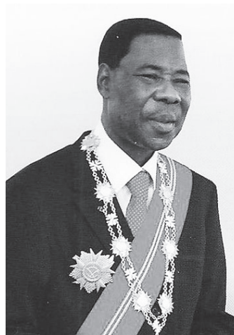
Benin President Yayi Boni

We should note that from the inception of the administration of President Yayi and since his re-election in March 2011, the government aims to transform the Benin economy into one of the emerging economies and the political system into a modern one. It is glorifying that these reforms and policies have begun to bear tangible fruits in repositioning the economy and has become one of the preferred destinations for foreign direct investment (FDI) in Africa. The results of these reforms have quickly made Benin a stable, peaceful and democratic reference in Africa. Because of this President Yayi received from his colleagues of Africa a mandate as chairperson of the African Union. Since then, he has been strengthening peace and democracy in Africa. Therefore, the African Union needs the support of the international community, of which Japan is an important member of all the decisions for democracy and peace in the world.