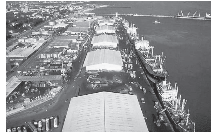
Economic center: Cotonou in the southeast of Benin is the country's largest city, a transport hub and a gateway to 300 million consumers in West Africa.

You can get in touch with the Benin Embassy through its website www.beninembassy.jp .