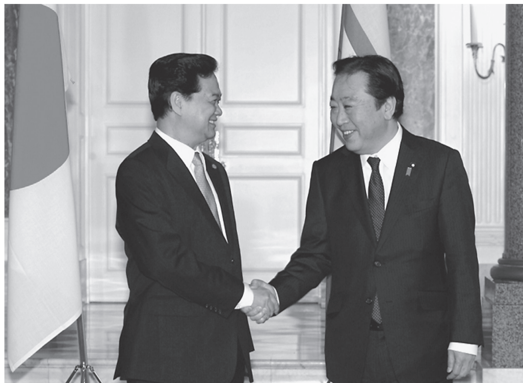
Strengthening ties: Vietnamese Prime Minister Nguyen Tan Dung meets with Prime Minister Yoshihiko Noda at Akasaka Palace in Tokyo on April 21 after attending the Mekong-Japan Summit meeting.

In our current national construction efforts, we are resolved to mainly rely on our inner strength, but also attach much importance to international support and cooperation, including from Japan. We cherish the excellent development of our bilateral relations in the past 39 years since the establishment of diplomatic relations. Vietnam and Japan currently enjoy increasingly effective multifaceted cooperation and are working together to realize a strategic partnership. Our relationship is characterized by a high degree of mutual trust and comprehensive cooperation in all fields. The exchange of delegations between the two countries, including high-level visits, is increasing, reflecting the bonds that we enjoy. Within 6 months, from November 2011 to April 2012, Vietnamese Prime Minister Nguyen Tan Dung visited Japan twice and engaged in very productive talks with Prime Minister Noda, manifested through the mutual understanding and agreement on all issues of mutual concern. The