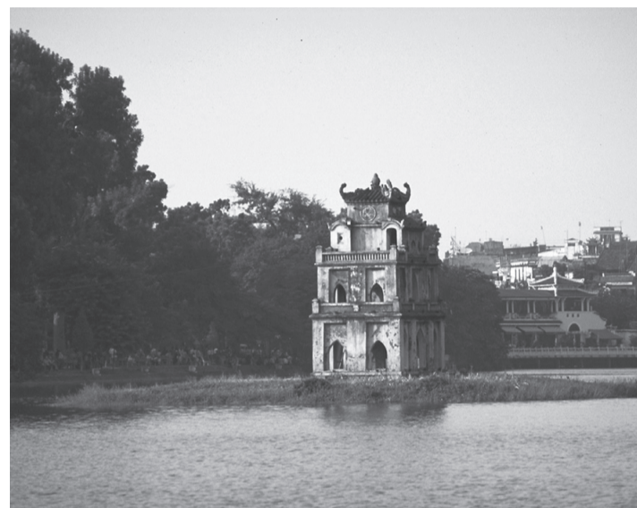
Scenic spot: Hoan Kiem Lake, also known as "Sword Lake," with the legendary Turtle Tower at its center, is situated in the historic district of the capital Hanoi and serves as a focal point of the city's public life.

Finally, allow me to express my sincere appreciation to The Japan Times for allowing us the opportunity to make an appearance in this edition and to all Japanese friends for providing assistance to us to celebrate Vietnam's National Day.