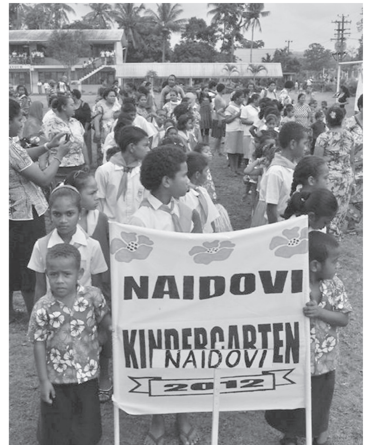
Future generations: Children gather at the early childhood celebrations held in Sigatoka on Sept. 22.

May I extend our sincere appreciation to all our corporate sponsors, the Japan-Fiji Friendship Society, friends of Fiji in Japan and members of the Fiji