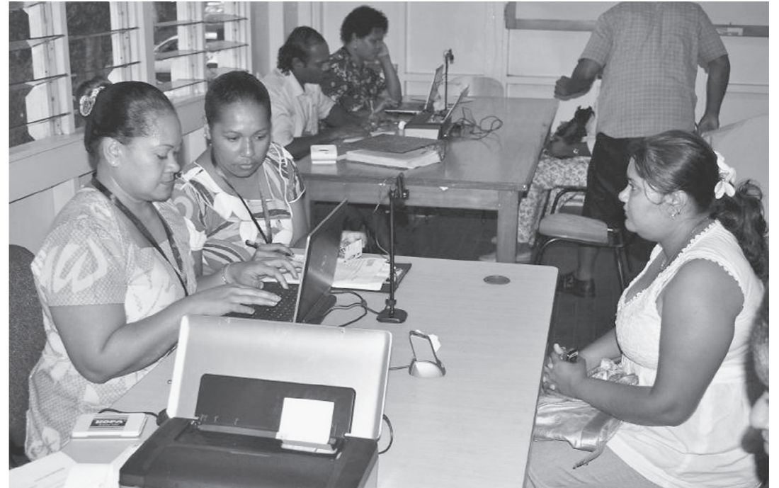
Democracy: Lautoka residents attend an electronic voter registration session.

With openings for direct foreign investment by the Bainimarama government into extractive industries, Fiji's economy in the next two to five years is expected to strengthen significantly from 2.7 percent gross domestic prod-