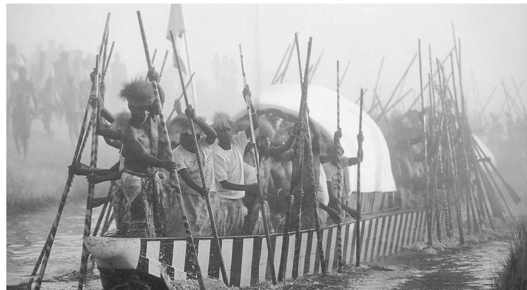
Culture: The Kuomboka Festival is one of Zambia's traditional ceremonies, which takes place at the end of the rainy season.

Finally, I wish to take this opportunity to thank the sponsors for making it possible for me to publish this message in The Japan Times.