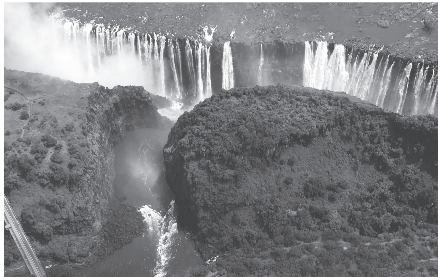
Nature: Zambia is home to the eastern side of the Victoria Falls, one of the seven natural wonders of the world. Right: Zebras are popular for safari tourism in Zambia.

Zambia is a constitutional democracy with a parliamentary system of governance. The country has low political risk and has been an oasis of peace since 1964 with changes of governments always achieved through peaceful democratic elections. Zambia's investment environment is recognized as being among the best in sub-Saharan Africa; Zambia was ranked among the top 10 best reformers in Africa by a World Bank business survey in 2011. It is one of the fastest growing economies