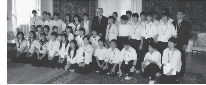
Future generation: The students from Namie, Fukushima Prefecture, visit Deputy Foreign Minister Vladimir Galuska (center) at the Ministry of Foreign Affairs in Prague on Aug. 3 during their stay in the Czech Republic from July 31 to Aug. 13.

Because in our opinion, it is on people such as these students and teachers, led by Yuko Sukumota, that the relationship between the Czech Republic and Japan really stands.