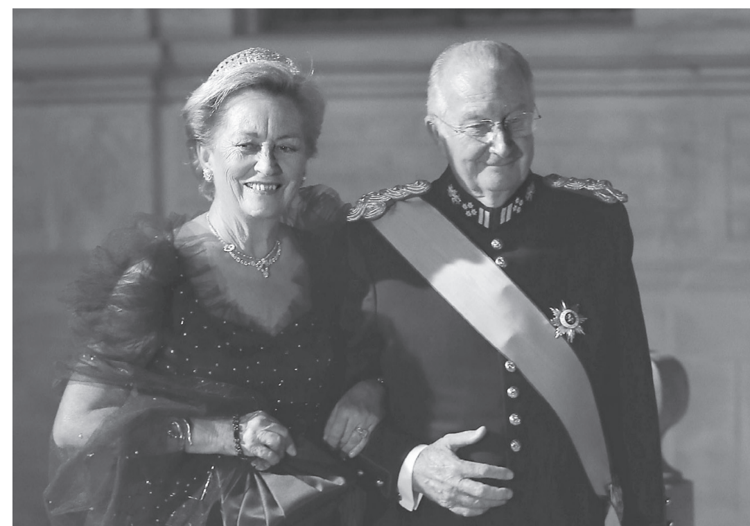
Royal pair: King Albert II and Queen Paola of Belgium attend the wedding of Luxembourg's heir, Prince Guillaume, and Countess Stephanie at the Royal Palace in Luxembourg on Oct. 19.