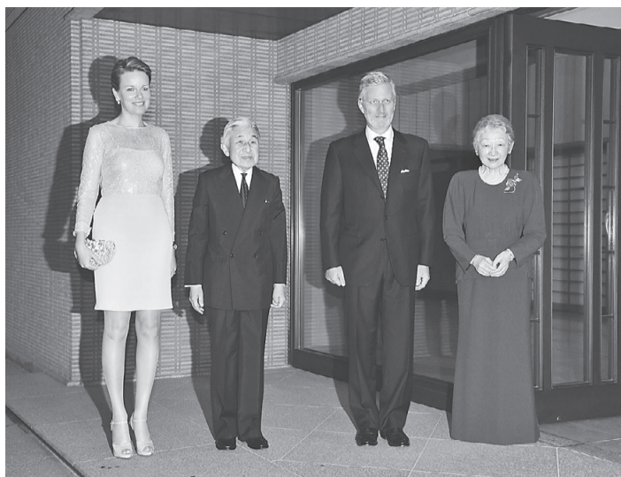
Long-standing relations: Emperor Akihito and Empress Michiko welcome Crown Prince Philippe and Princess Mathilde to the Imperial Court on June 12 during the latter couple's visit to Japan on an economic mission.

However, this 2012 economic mission was not only about trade, investment relations, academic cooperation and bilateral ministerial meetings. The warm ties of friendship between the Japanese and Belgian reigning families were reinforced as Their Royal Highnesses Prince Philippe and Princess Mathilde were kindly received by Their Imperial Majesties Emperor Akihito and Empress Michiko and met with Their Imperial Highnesses Crown Prince Naruhito and Princess Masako and Prince and Princess Hitachi. The traditionally warm relationship between the royal family of Belgium and the Imperial family of