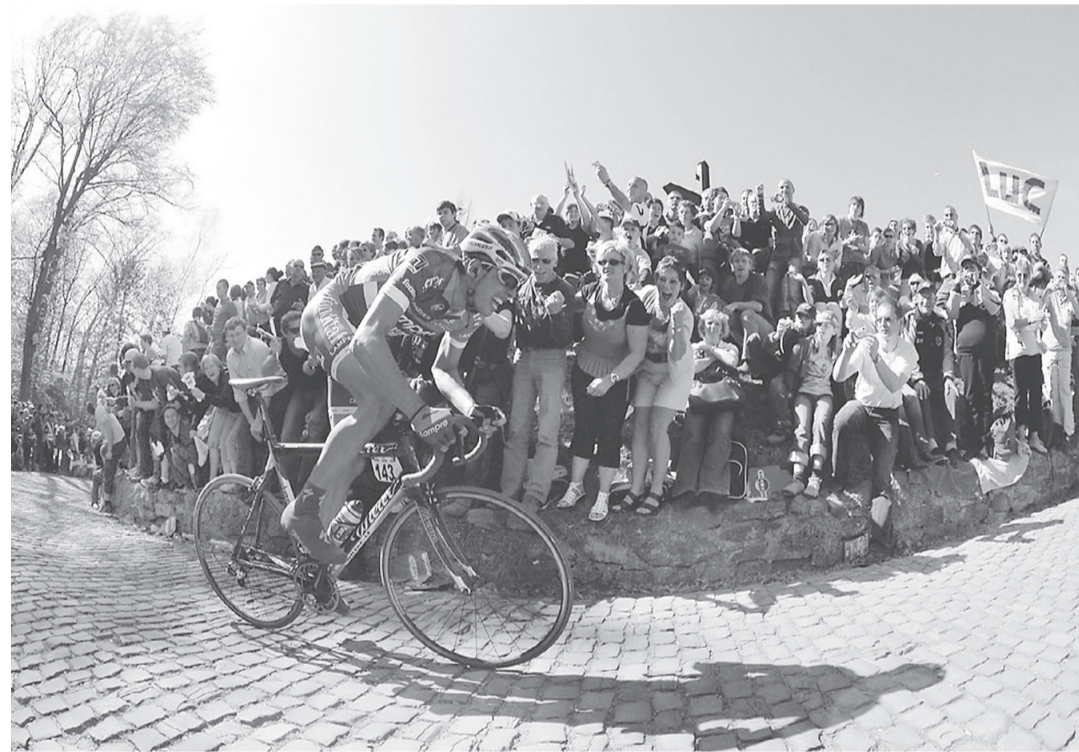
Enthusiasm: Next year on May 25 will be exactly 100 years since the first Tour of Flanders. The region is planning celebrations, exhibitions, events and new cycling routes.

Congratulations on the Belgian King's Day