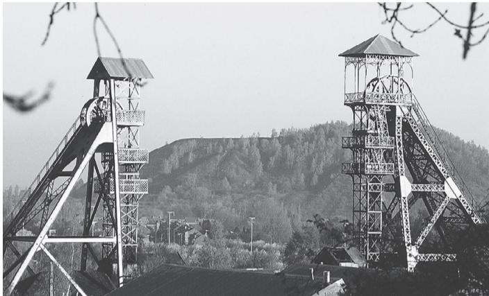
Cultural heritages: The Bois du Cazier is one of the four best preserved places of coal mining in Belgium. Below, the Ducasse de Mons is a popular festival featuring the procession of St. George.

Mons is also known for the Ducasse de Mons, listed as a