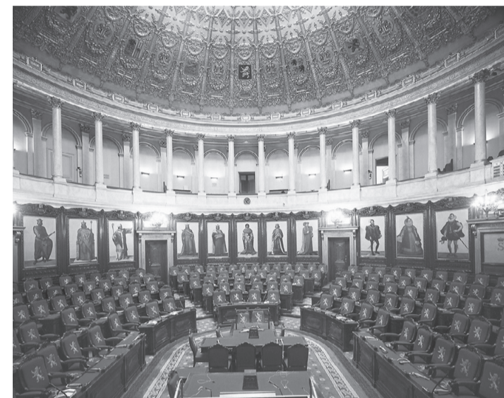
Constitutional monarchy: The Belgian Senate is one of the hearts of the country's federal legislative power.