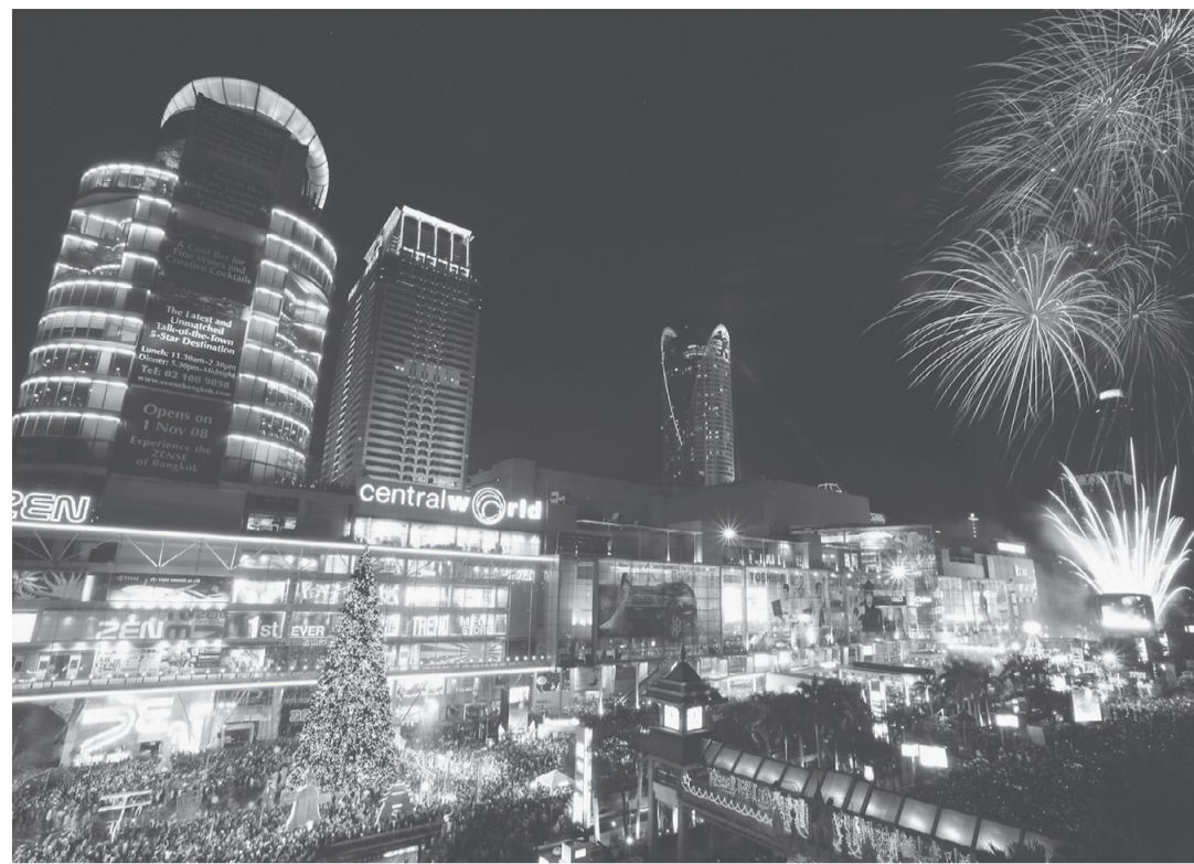
Countdown: New Year's Eve is actively celebrated in Bangkok, featuring various events accompanied by laser beam light shows and fireworks. ROYAL THAI EMBASSY