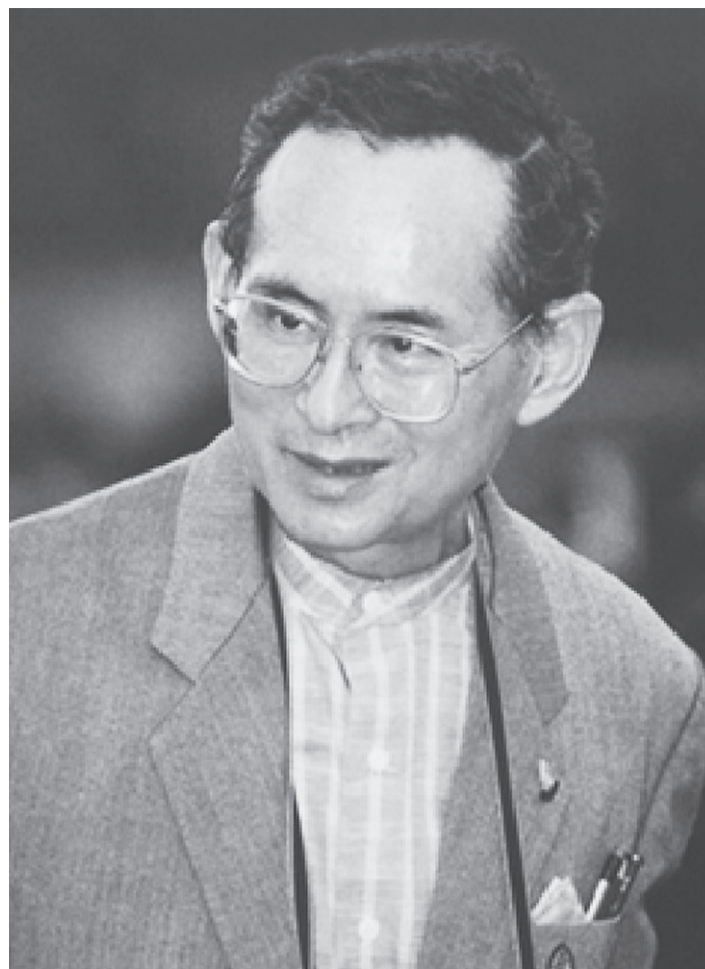
His Majesty King Bhumibol Adulyadej of Thailand

Beyond the bilateral perspective, there are still vast potentials