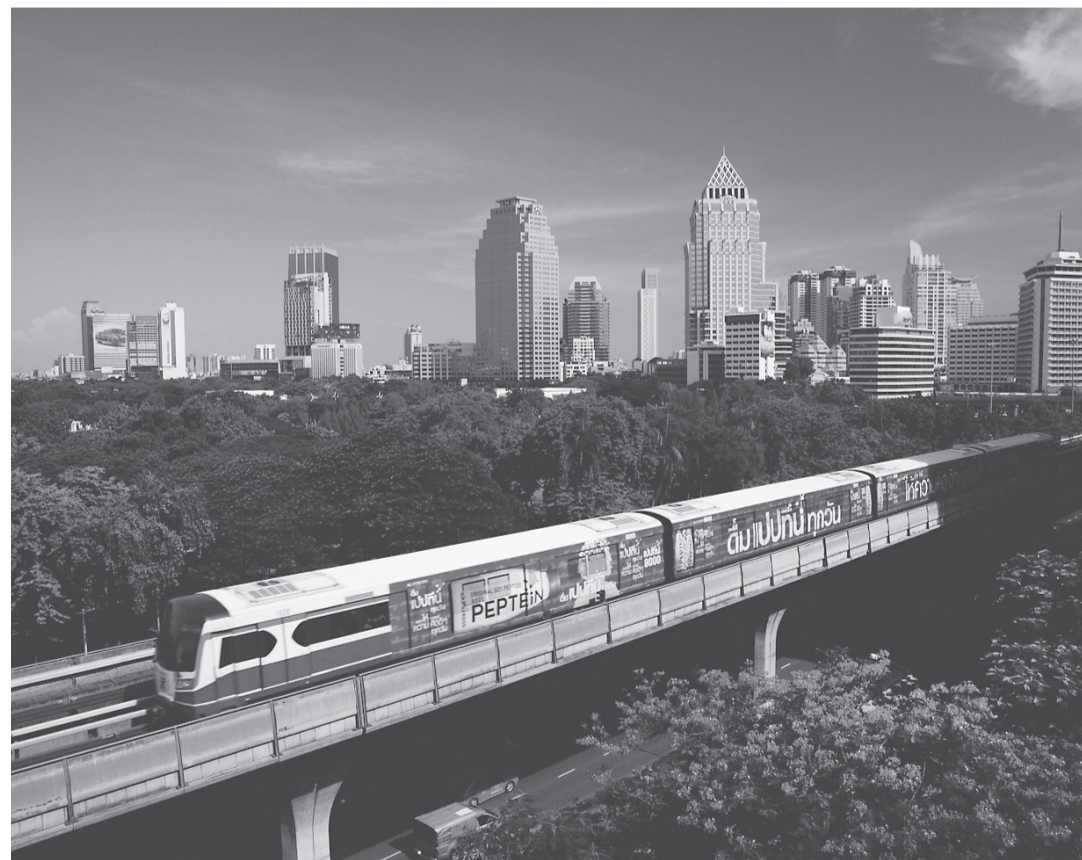
Transportation: The Bangkok Mass Transit System, commonly known as the BTS Skytrain, is an elevated rapid transit system in the capital. ROYAL THAI EMBASSY

Finally, on the auspicious occasion of the 85th birthday of His Majesty King Bhumibol Adulyadej, I would like to once again hope that the mutual trust fostered between Japan and Thailand becomes even more enduring in light of our two countries' many years of a close and amicable relationship.