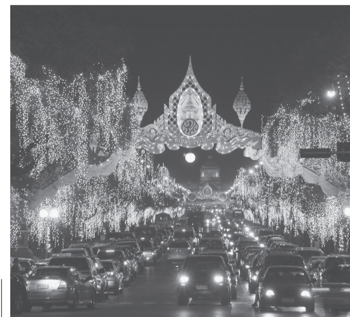
Festive: Bangkok is illuminated in celebration of the birthday of His Majesty King Bhumibol Adulyadej.

Just before the 40th anniversary next year of Japan-ASEAN Friendship and Cooperation, we pray for the further development of Japan-Thailand relations.