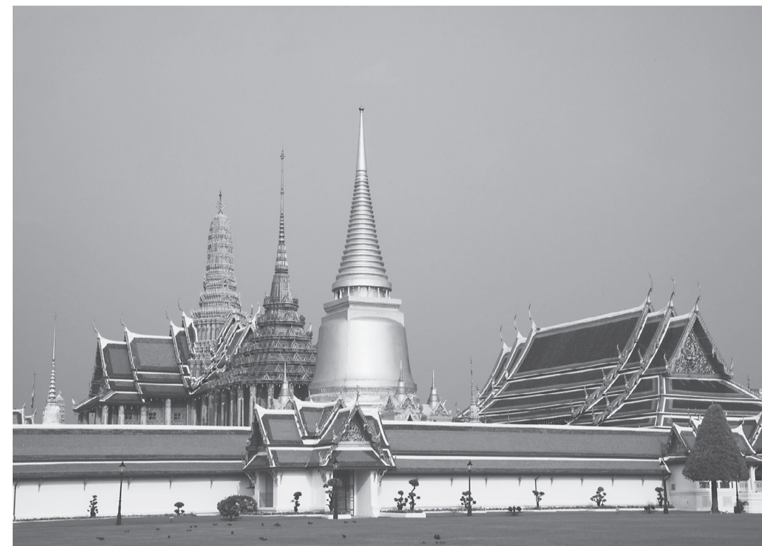
Majestic: The Grand Palace in Bangkok, formerly the official residence of the kings of Thailand, is now used for ceremonial purposes. Wat Phra Kaew, or the Temple of the Emerald Buddha, is a royal chapel situated within the walls of the palace.

2015. Taking into account Thailand's strategic location at the crossroads of the ASEAN main land, the Thai government has strongly committed to realizing