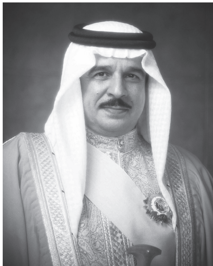
His Majesty King Hamad bin Isa Al Khalifa of Bahrain

The nation of the Kingdom of Bahrain, with the democratic reforms of H.M. King Hamad bin Isa Al Khalifa, the premiership of His Royal Highness Prince Khalifa bin Salman Al Khalifa, and the economic vision of His Royal Highness Prince Salman bin Hamad Al Khalifa, is managing the global challenges of the third millennium by working in harmony and peace with all the nations of the Middle East, the Arab world, the Islamic countries, and the rest of the East and