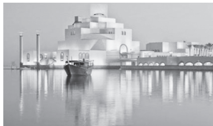
The Museum of Islamic Art, Doha, Qatar EMBASSY OF QATAR