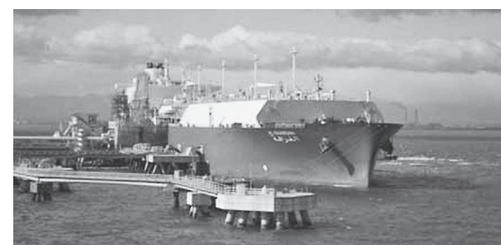
Liquefied natural gas (LNG) is loaded onto a tanker ship in Qatar.

gas (LPG), respectively, making Qatar the fourth biggest energy supplier to Japan; however, Qatar is also benefiting from Japanese investment and expertise in various large-scale projects. Currently, there are over 40 Japanese companies with offices in Qatar, and their focus is on the construction, shipping and energy sectors.