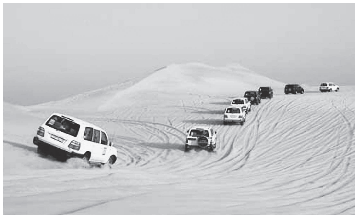
Desert in Qatar

The United Nations Framework Convention on Climate Change held the 18th Conference of Parties (COP18) at Doha chaired by H.E. Abdullah Bin Hamad Al-Attayah from November to early December. I believe it was a timely event to be held in Doha, where LNG, with low environmental impact, is set as the business axis for developing Qatar. More responsibilities and contributions from the State of Qatar besides COP18 will be requested by the international society. The State of Qatar deserves to be in such a position. I expect the State of Qatar to play more important roles in the international society alongside Japan.