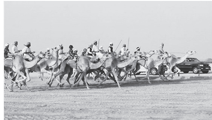
Camel racing in Qatar

In closing, I wish to express my deepest appreciation to The Japan Times for giving me this opportunity to address its distinguished readers on this happy occasion and I would like to express my best wishes for all to have a happy, peaceful and prosperous New Year.