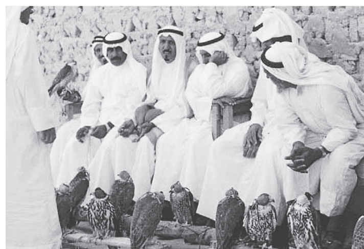
Traditional dress in Qatar EMBASSY OF QATAR