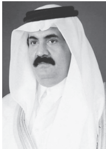
H.H. Sheikh Hamad Bin Khalifa Al-Thani, the Emir of the State of Qatar

The Qatari people, fully aware and quite assured that