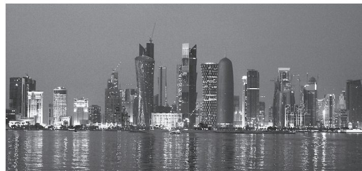
Doha skyline: The city center EMBASSY OF QATAR