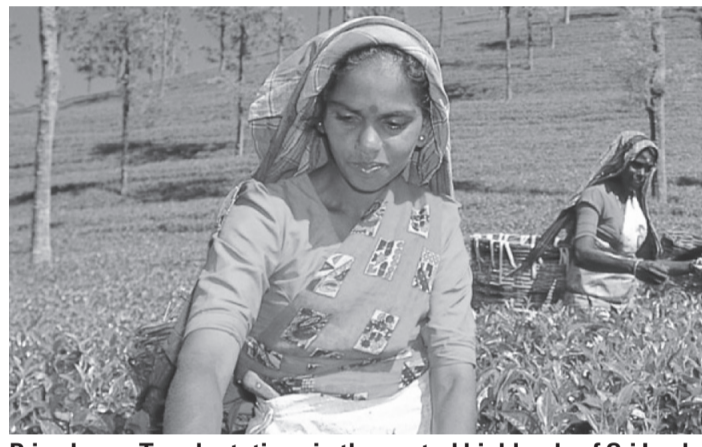
Prized crop: Tea plantations in the central highlands of Sri Lanka.

have taken place in the country after the defeat of terrorism has trickled down to every part of the country. The programs such as, Gama Neguma, Gemi Deriya, Divi Neguma, etc., under the Mahinda Chintana vision for the future contribute immensely for the uplifting of the economic and living standards of the people. The network of roads, expressways, high-rise buildings, shopping malls, residential towers and hotel complexes testify to the growing strength of the country's economy. The peace and tranquility prevailing in the country have attracted tourists into the country in large numbers. The increased interest shown by foreign investors in the stock market is ample testimony to a robust economy. Mega-projects like Hambantota Harbour, Colombo Harbour De-