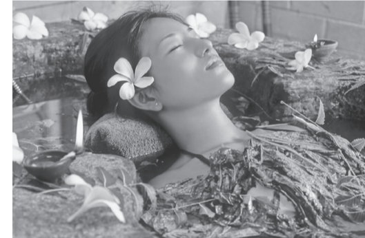
Beauty and tradition: A woman undergoes ayurveda treatment. Right: Ancient frescos at the ruins of Sigiriya, a UNESCO World Heritage site, depict women known as "Sigiriya Ladies."

The key challenges relating to Sri Lanka's national security, sovereignty and territorial integrity, and economic and cultural diplomacy, as enunciated in the