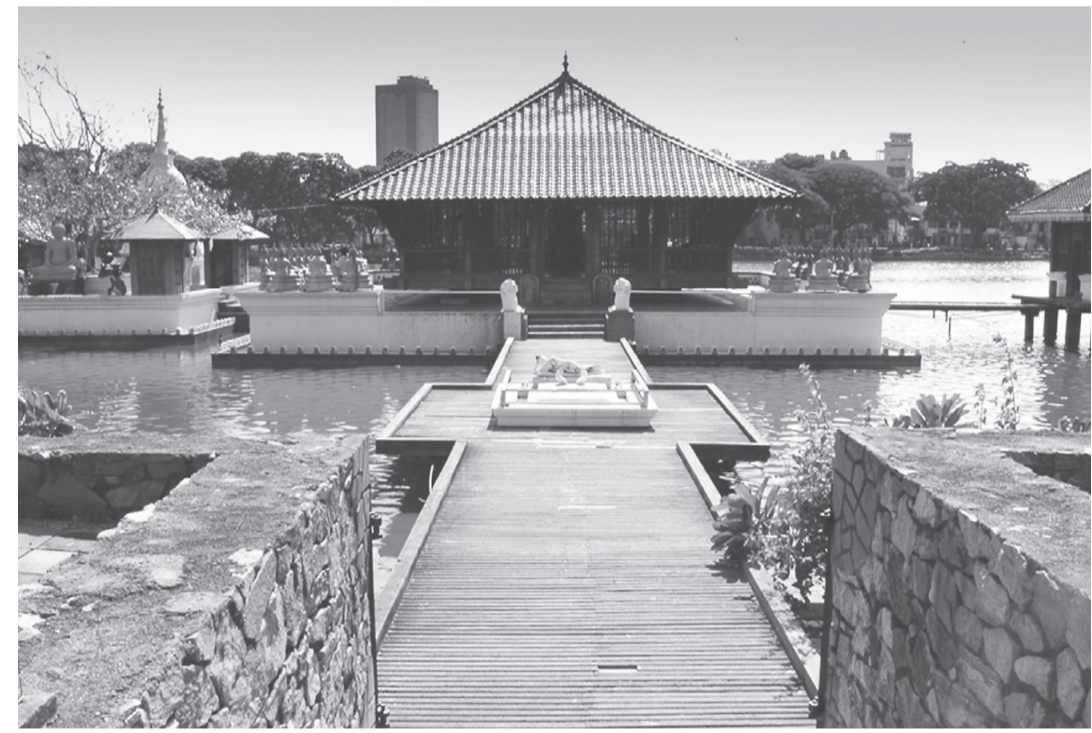
Ecclectic structure: Gangaramaya Temple in Colombo features a mix of Sri Lankan, Thai, Indian and Chinese architectural styles.

activities are in full swing in the country it is incumbent on all citizens to cooperate and assist the government in its development effort. Let us resolve ourselves on this Independence Day to join hands to work together as patriotic citizens for the common good and advancement of our motherland.