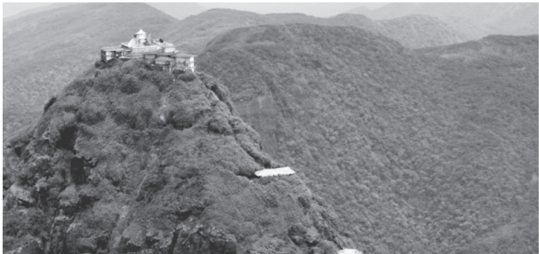
Sacred mountain: Sri Pada, also known as Adam's Peak, stands in central Sri Lanka and is revered as a holy site by Buddhists, Hindus, Muslims and Christians.

We salute and pay our homage to all patriots who have made the supreme sacrifice to safeguard the freedom and sovereignty of the nation.