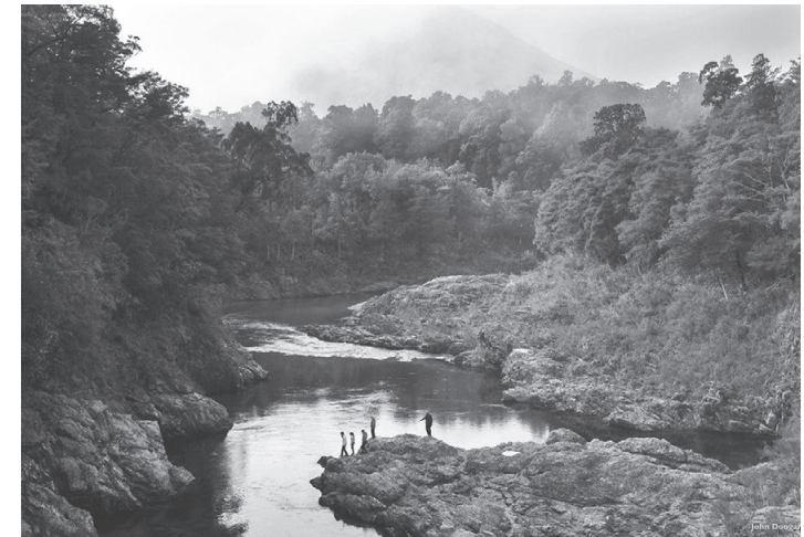
Magical setting: West of the town of Blenheim, the Pelorus Bridge Scenic Reserve is the perfect place for a picnic or a spot of trout fishing. In summer, the river might tempt visitors for a cooling swim.

Tourism New Zealand and Air New Zealand will also look to promote hiking in New Zealand including the world-famous Great Walks of New Zealand. Air New Zealand with the Department of Conservation have recently held a Great Walker competition (hike the nine Great Walks in New Zealand over nine weeks) and one of the four winners picked globally was Japanese. He leaves for New Zealand next month and we will all be watching his adventure unfold with keen interest and some degree of envy!