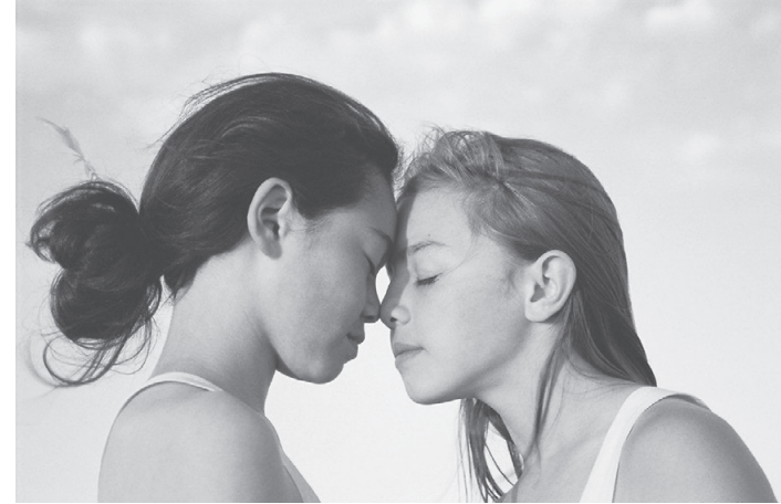
Friendly exchange: Still conducted in New Zealand today, the "hongi" is a traditional Maori greeting performed by pressing one's nose and forehead to another person's to "share the breath of life."

Tourism New Zealand and Air New Zealand will continue our