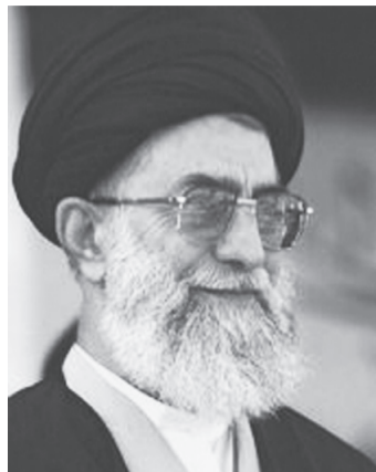
Ayatollah Ali Khamenei, supreme leader of the Islamic Republic of Iran

During the past 34 years, the Islamic Republic of Iran has confronted many adversaries and plots, including eight years of an imposed war. The Islamic Republic of Iran has always sought international cooperation, and extended its friendship to all nations by emphasizing the mutuality of interests and noninterference in the internal affairs of other countries. "Détente" is the main agenda of our foreign policy, and in order to approach this policy the Islamic Republic of Iran has tried from its inception to give priority to confidence-building through the exchange of visits and the holding of international gatherings. Nowadays, the Islamic Repub-