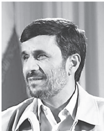
Mahmoud Ahmadinejad, president of the Islamic Republic of Iran

The Islamic Republic of Iran is against the production, stock-