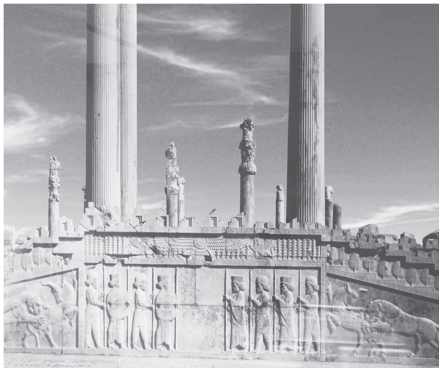
Long history: Located near the modern city of Shiraz, the ancient ruins of Persepolis, the capital of the Achaemenid Persian Empire (c. 550-330 B.C.), are designated as a UNESCO World Heritage site. Right: A map of Iran shows the geopolitical significance of the nation, owing to its location in three spheres of Asia (West, Central and South).

Iran, as one of the oldest civilizations, and a country that extended into Asia and the Middle East, possesses a very rich culture. In general, Iranians, similar to the people of Japan, are art lovers. They express their attitude in architecture, paintings, ceramics, poetry, drama, movies, gardening, etc. According to UNESCO's classification, three of the 12 most important World Heritage sites are located in Iran, making this country one of the most important touristic places in the world. Today the works of Iranian culture and civilization are seen in many museums around the world, but Iran by itself is a vast museum in which you can see hills, archaeological sites such as Persepolis and Pasargadae, old houses, palaces, etc. In the museums of Iran you can see thousands of mementos golden bowls, clay creations from the New Stone Age, and works from the Islamic era such as handwritings, ornaments, miniatures, and many